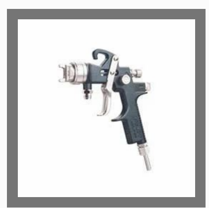
Spray Guns Without Cup