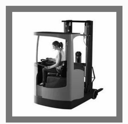
Sit On Reach Trucks