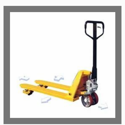
4 Way Pallet Truck