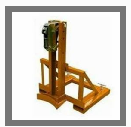
Drum Fork Lift Attachment