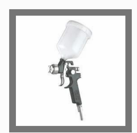
Shade Spray Guns