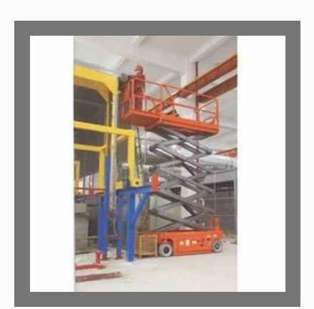
Self Propelled Scissor Lifts