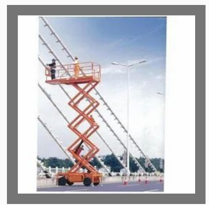
Mobile Heavy Duty Scissor Lift