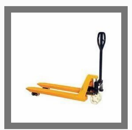
5000 kg Pallet Truck