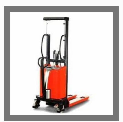
Semi Electric Stackers