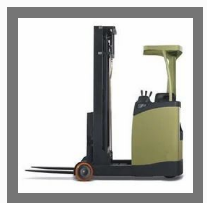
Stand On Reach Trucks