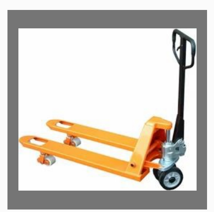
Hand Pallet Truck