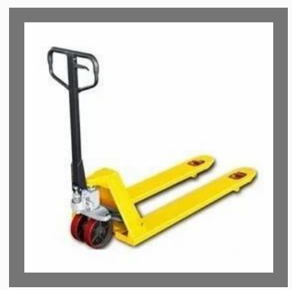
Low Profile Pallet Truck