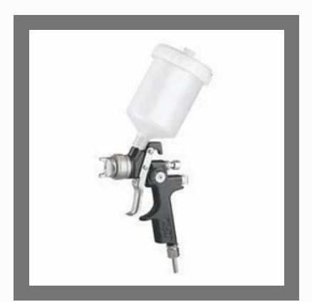
Manual Spray Guns