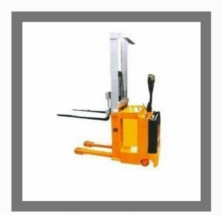
Battery Operated Stacker