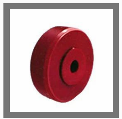
Construction Castor Wheel