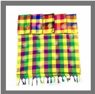
Paithani Designer Saree