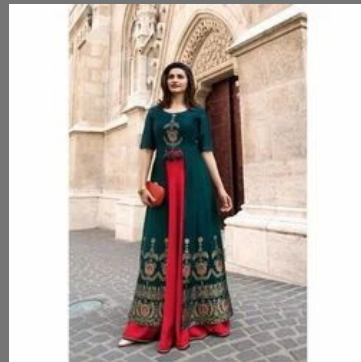
Party Wear Designer Gown