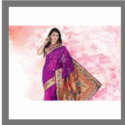
Silk Paithani Saree