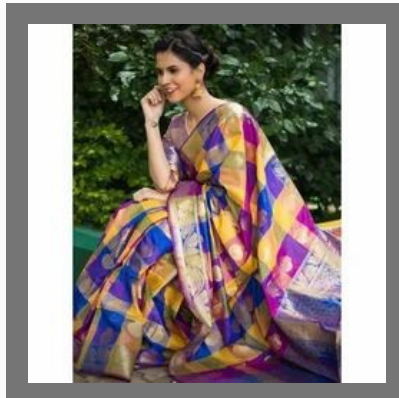
Designer Silk Saree