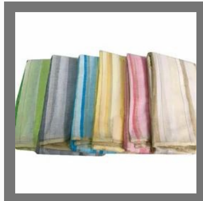
Linen Designer Saree