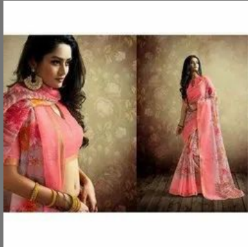
Designer Printed Saree