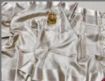
Silver Linen Saree