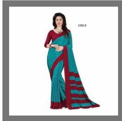
Designer Stylish Saree