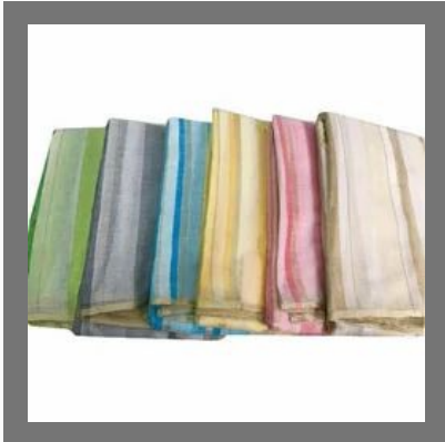
Linen Organza Saree