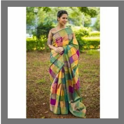
Party Wear Silk Saree