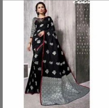
Fancy Silk Saree