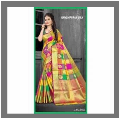
Kanchipuram Silk Saree