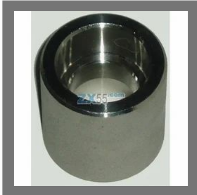
Stainless Steel Socket weld Fitting