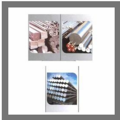
Stainless Steel Hex Bars