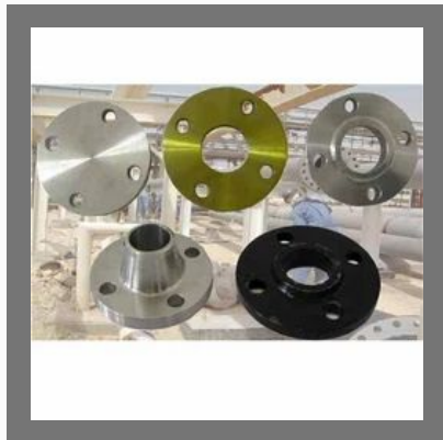
Carbon Steel Flanges