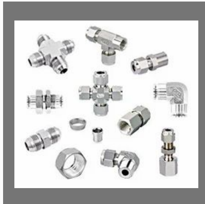
Stainless Steel Tube Fittings & Fastener