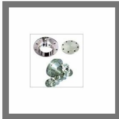
Alloy Steel Flanges