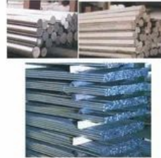
Stainless Steel Round Bar,Hex Bar & Square Bar