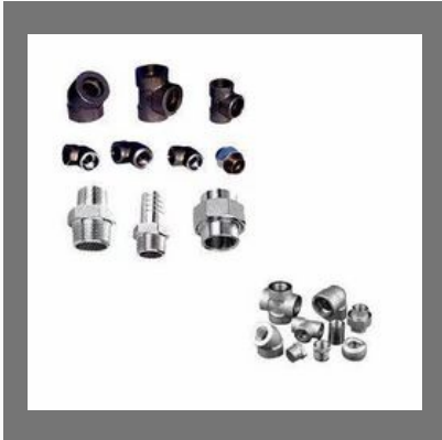
Stainless Steel Forged Fittings