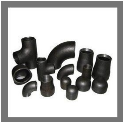
Alloy Steel Butt Weld Fittings