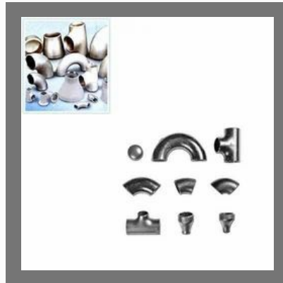
Stainless Steel Butt Weld Fittings