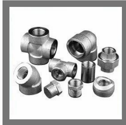
Alloy Steel Socket Weld Fitting