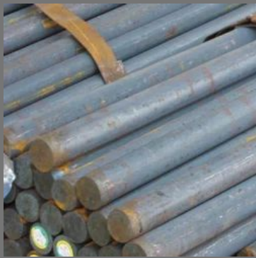
Carbon Steel Round Bar,Hex bar & Square Bar