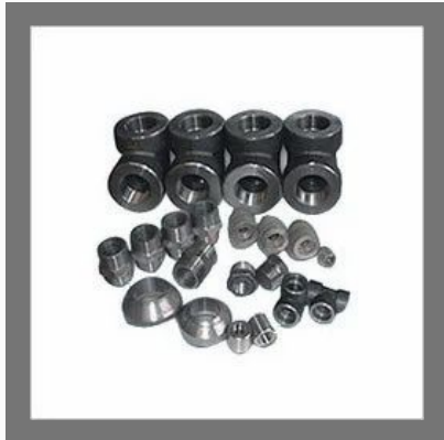
Stainless Steel Tube Fittings