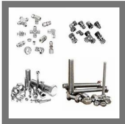
Stainless Steel Fastener & Tube Fittings