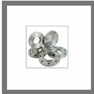
Stainless Steel Flanges