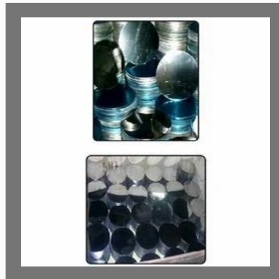
Stainless Steel Circle