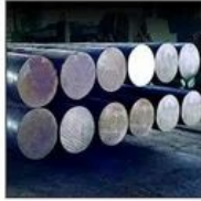
Alloy Steel Round Bar,Hex bar & Square Bar