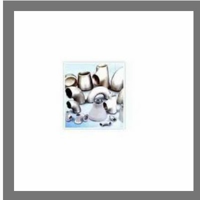
Alloy Steel Butt Weld Fittings