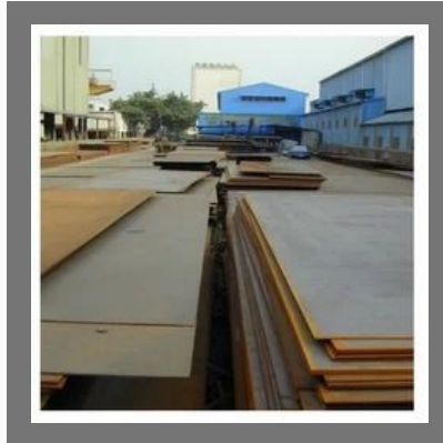
Carbon Steel & Alloy Steel Sheet , Plates.