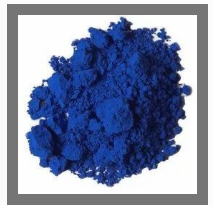
Ultramarine Blue Pigment