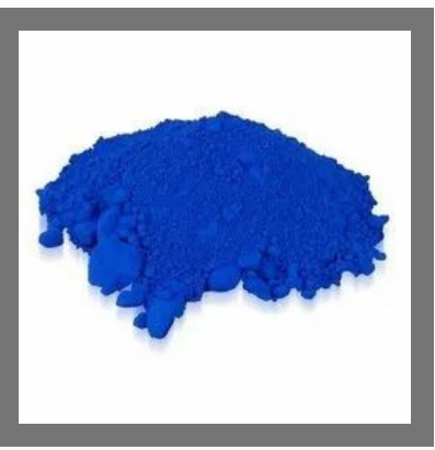
Ultramarine Blue Pigment (Laundry Grade)