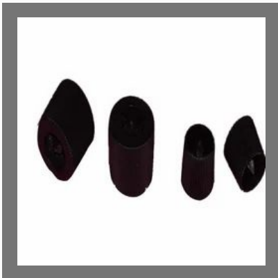
Thermoplastic Injection Moulded Caps