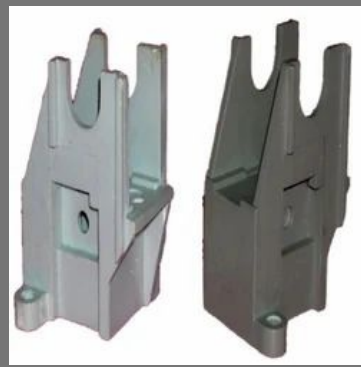
DMC Compression Moulded Parts