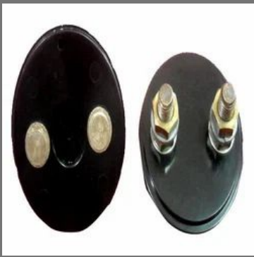
Transfer Moulded MCL Rotary Switch