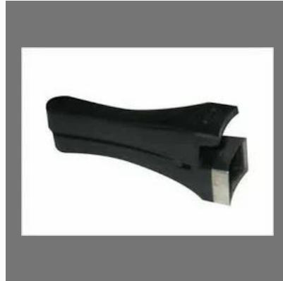
Pressure Cooker Handle