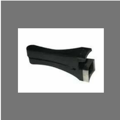
Pressure Cooker Bakelite Handle