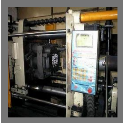
Bakelite Injection Mould