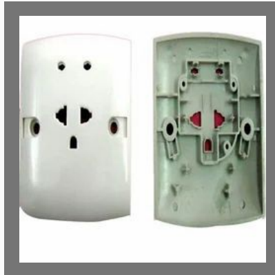
Compression Moulded Switch Plate