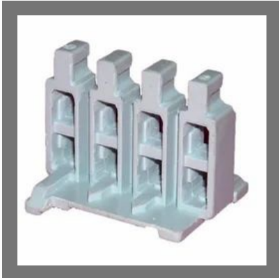
Melopas Injection Moulded Contact Carrier