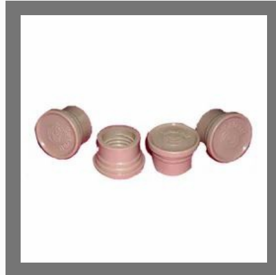
Thermoplastic Injection Moulded Caps