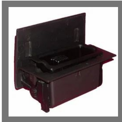
Bakelite Injection Moulded Car Ash Tray