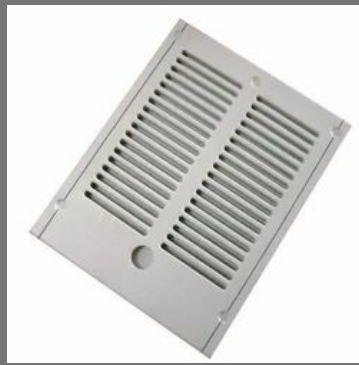
Compression Moulded ACB Arc Chute Cover