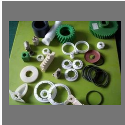
Engineering Plastic Parts