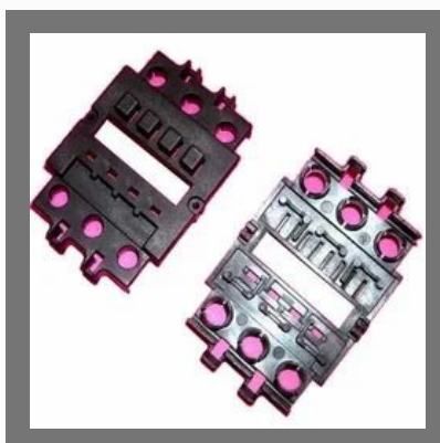
Injection Moulded Terminal Cover