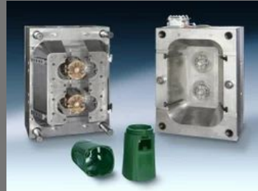
Plastic Injection Moulds