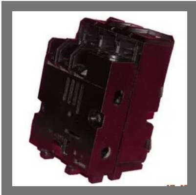
Bakelite Injection Moulded Relay Housing