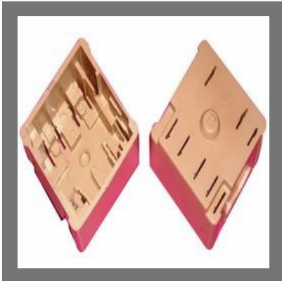
Melamine Injection Moulded Rotary Switch Parts