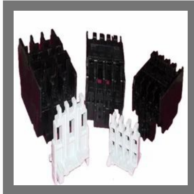
Bakelite Injection Moulded Switchgear Parts