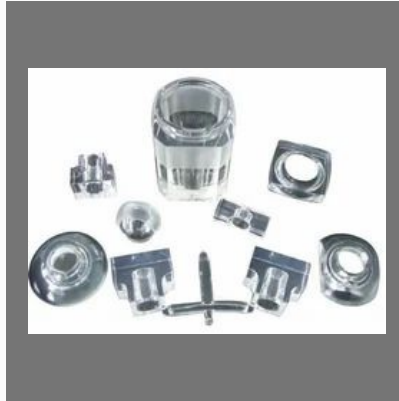
Precision Moulding Parts