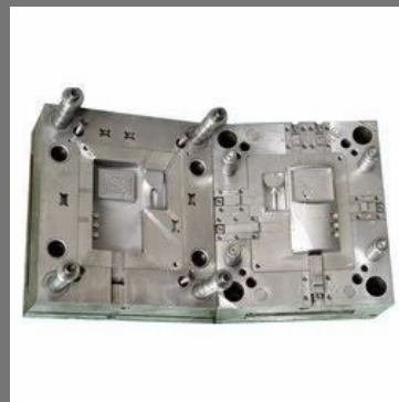
Custom Injection Moulding Products