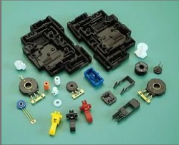
Plastic Moulding Parts