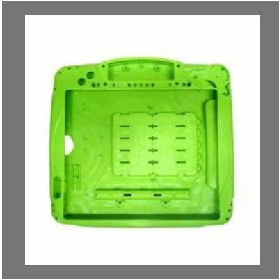
Injection Plastic Moulded Parts