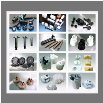
Industrial Plastic Parts