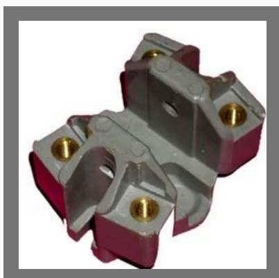
DMC Compression Moulded Parts