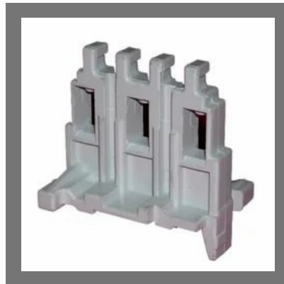
Melopas Injection Moulded Parts