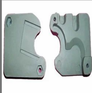
Compression Moulded Arc Shield