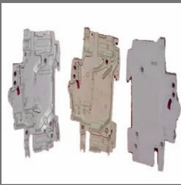
Compression Moulded MCB Housing