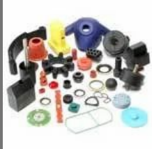
Plastic Moulded Products