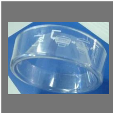
Plastic Moulded Components