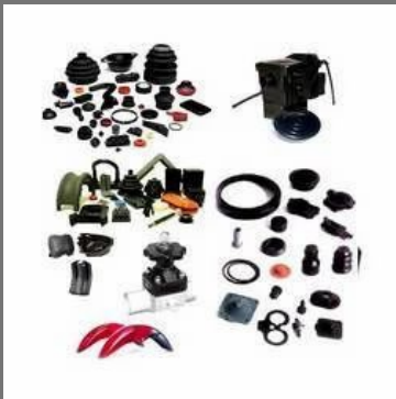
Industrial Plastic Component