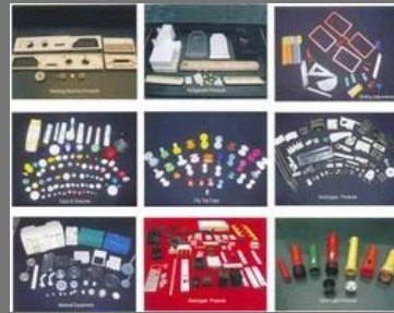
Precision Plastic Moulds