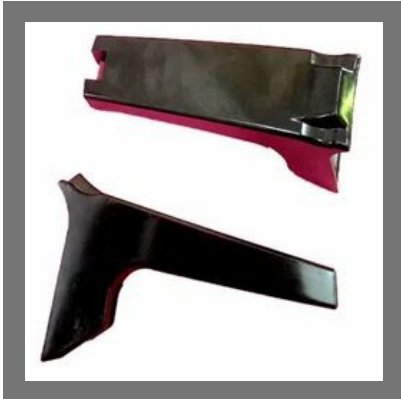
Bakelite Injection Moulding Cookware Handle