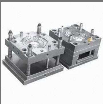
Injection Moulding Tools