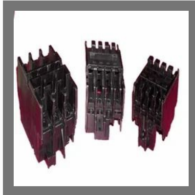
Melopas Injection Moulded Contactor Top