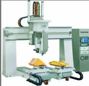
CNC 6 Axis Machine