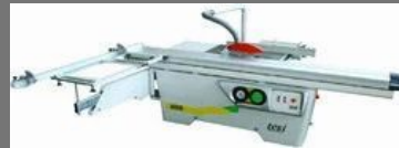
Sliding Table Panel Saw