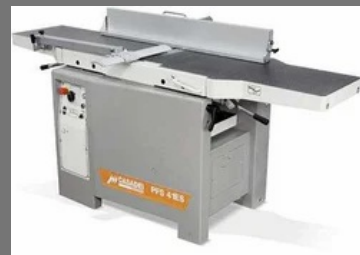
Combined Planer - Thicknesser