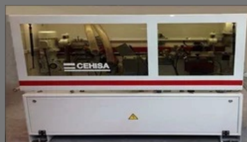
Edge Banding Machine : Cehisa