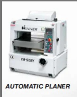
Automatic Planer With Spiral Cutter : Winner