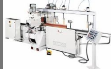
Copy Shaping Machine