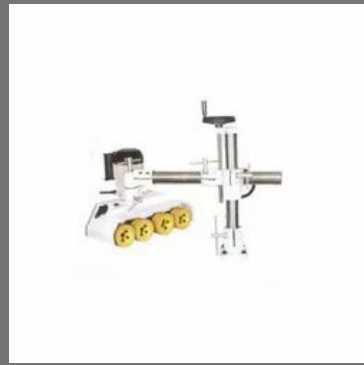
Heavy Duty Feeder