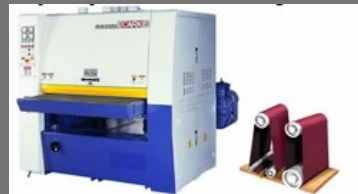
Sanding Machine : Boarke