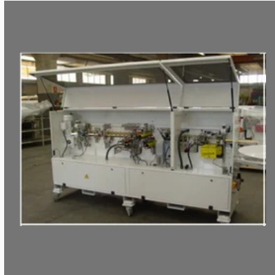
Edge Banding Machine : Cehisa