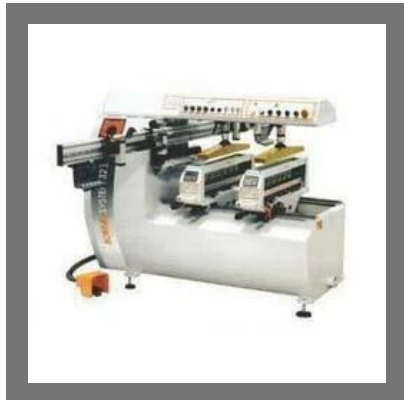
Semi Automatic Panel Boring Machine