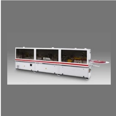
Edge Banding Machine : Cehisa