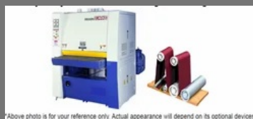
Sanding Machine : Boarke