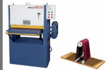
Sanding Machine : Boarke