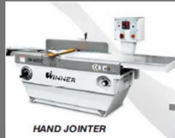
Surface Planer With Spiral Cutter : Winner