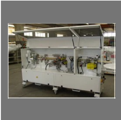
Edge Banding Machine : Cehisa