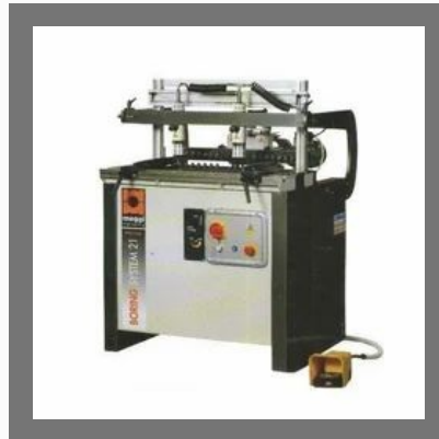
Dowel Boring Machine