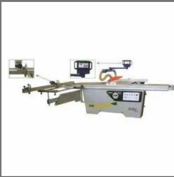
Programmable Panel Saw