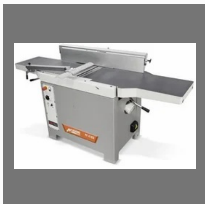
Surface Planer : Casadei