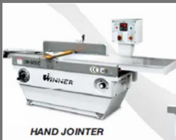
Surface Planer With Spiral Cutter : Winner