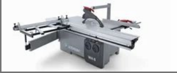
Altendorf Panel Saw WA 8T