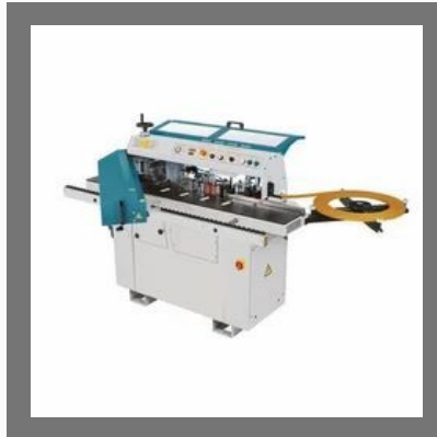
Edge Banding Machine