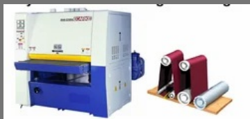
Sanding Machine : Boarke