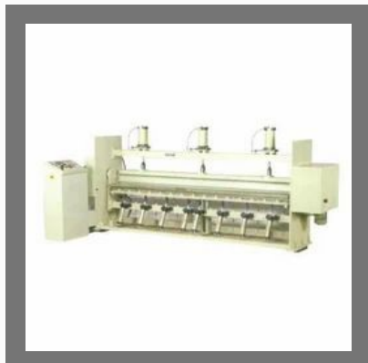
Post Forming Machine