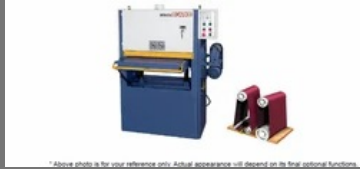
Sanding Machine : Boarke