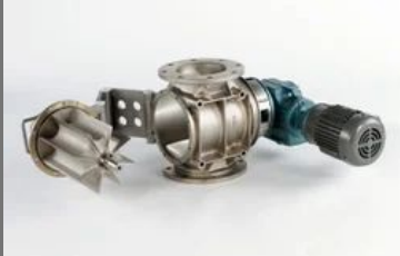
4 Roller Power Feeder