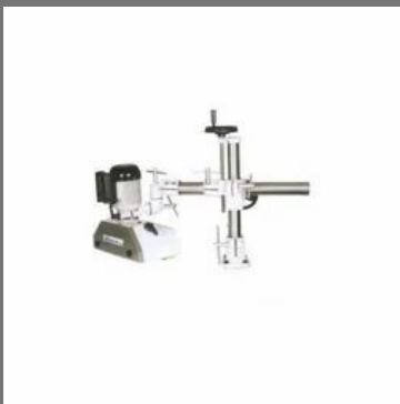
3 Roller Power Feeder