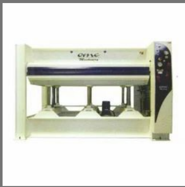
Hydraulic Hot Press Machine