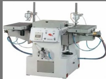
Mortising Machine - Automatic Oscilating With Two Table