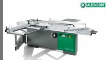
Altendorf Panel Saw