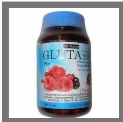
Gluta 20000 mg Glutathione Skin Whitening Pills