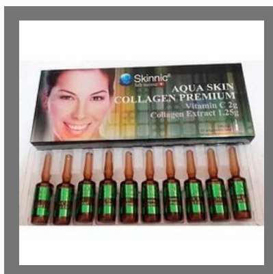
Skinnic Aqua Skin Collagen Premium Injection