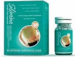
Slimina Weight Loss Capsules