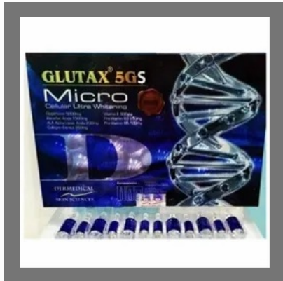
Glutax 5GS Micro 5000mg Glutathione Injection