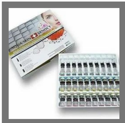
Aqua Skin Veniscy Glutathione Injection