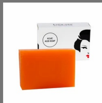
Kojie San Skin Lightening Soap