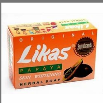
Likas Papaya Skin Whitening Soap