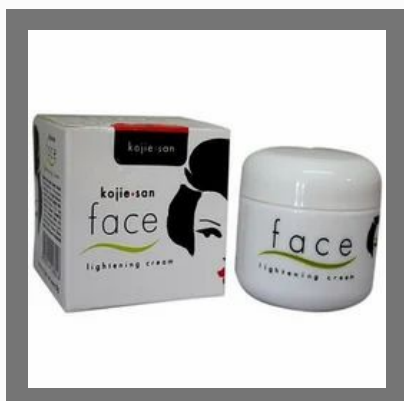
Kojie San Face Lightning Cream