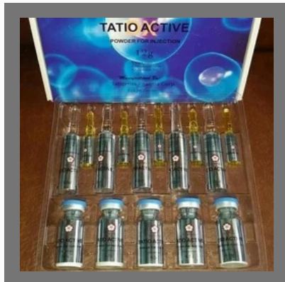
Tatio Active Glutathione Injection