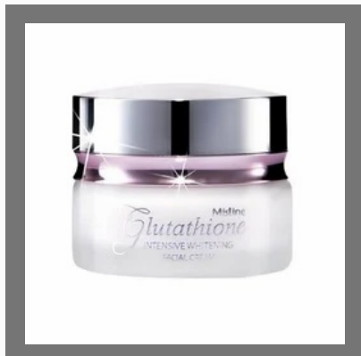
Misline Glutathione Intensive Whitening Facial Cream