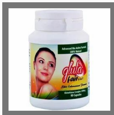
Gluta Fair 5 In 1 Skin Whitening Pills