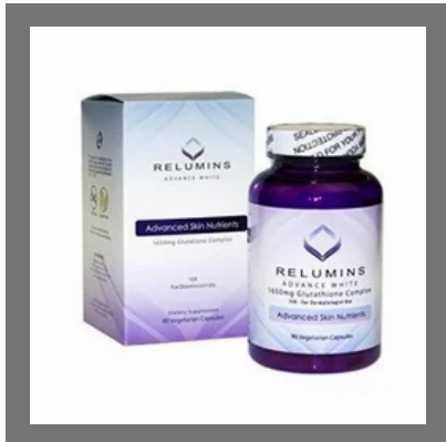
Relumins 1650mg Advance White Skin Glutathione Complex Capsule