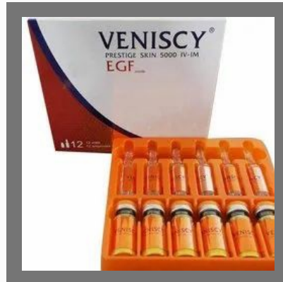
Veniscy Prestige Skin 5000 EGF Glutathione Injection