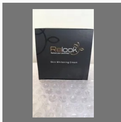
Relook Skin Whitening Cream