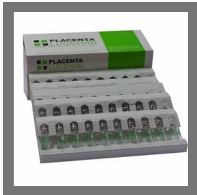
Placenta Lucchini Injection