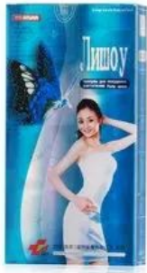
Lishou Slimming Capsules