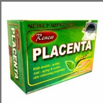
Renew Placenta Classic Soap