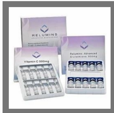
Relumins Advance Glutathione Injection