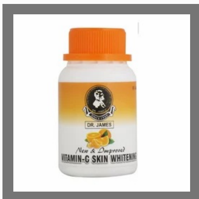
Dr James Vitamin C Skin Whitening Capsules