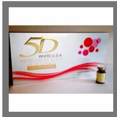
5d White Usa Micro Gluta 20000