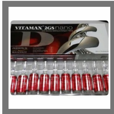
Vitamax 2GS Nano injections