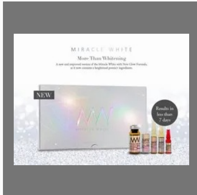
Miracle White Skin Whitening Injection