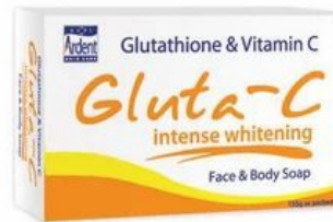
Gluta C Skin Intence Whitening Face Soap