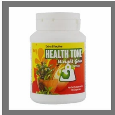
Health Tone Weight Gain Formula