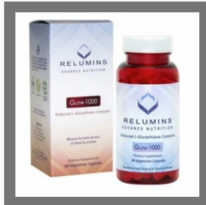
Relumins Advanced L Glutathione Dietary Capsules