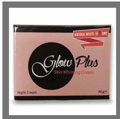
Glow Plus Fairness Cream