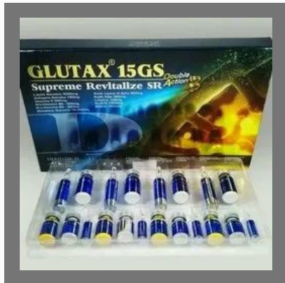
Glutax 15gs Double Action Glutathione Injection