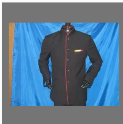
Indo Western Wear