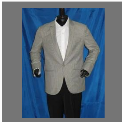
Jacket With Formal Trouser