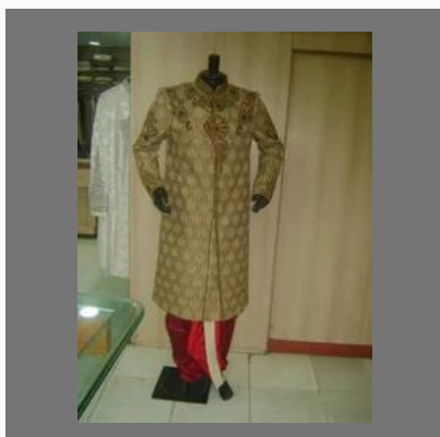
Traditional Wear Mens Suit