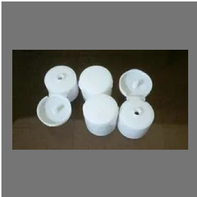
Flip Top Cap 25 mm