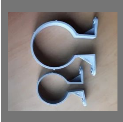
110mm PVC Pipe Clamp