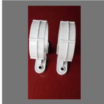
75mm UPVC Pipe Clamp