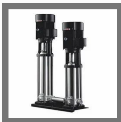
Industrial RO Pump