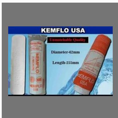
Kemflo Spun - RO Part