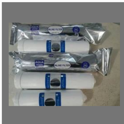
Inline Aquagrand Reverse Osmosis Plant