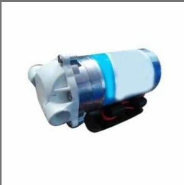
100 Gpd Pump