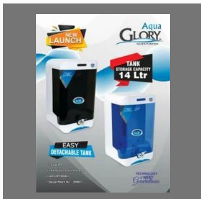
Aqua Glory RO Cabinet