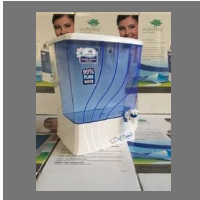
Water Lilley Purifiers