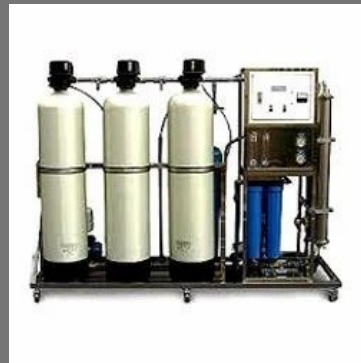
LPH Industrial RO Plant