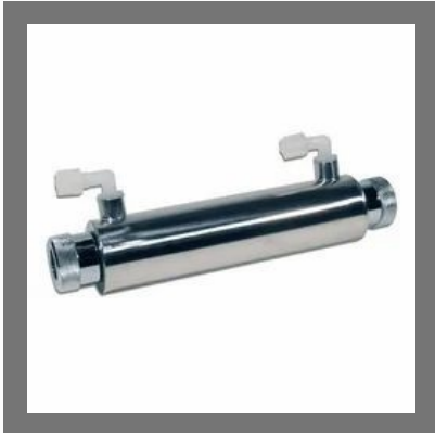
UV Water Filter