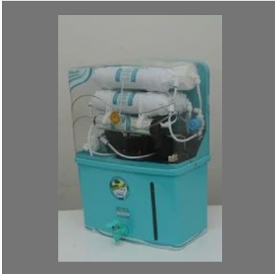
Aqua Grand Reverse Osmosis Cabinets