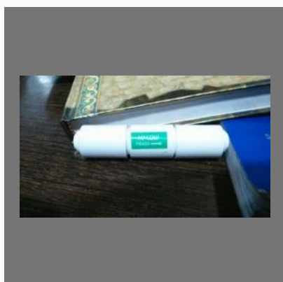
Kflow FR RO Membrane