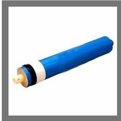
Vontron RO Membrane