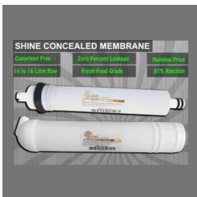
Shine 80 RO Membrane