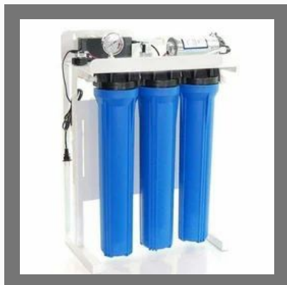
Water RO System