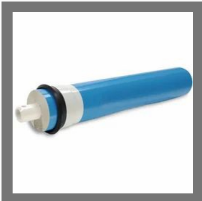
Filmtec RO Membrane