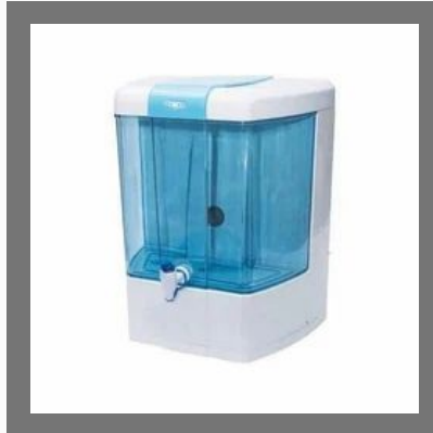
Reverse Osmosis Cabinet