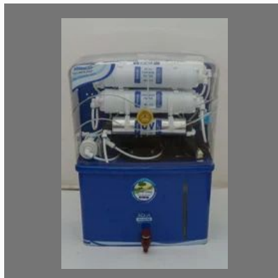
Aqua Grand Color RO Cabinet