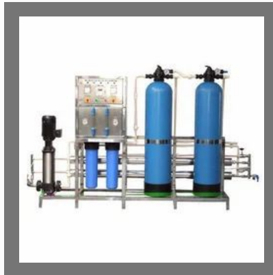
Industrial RO System