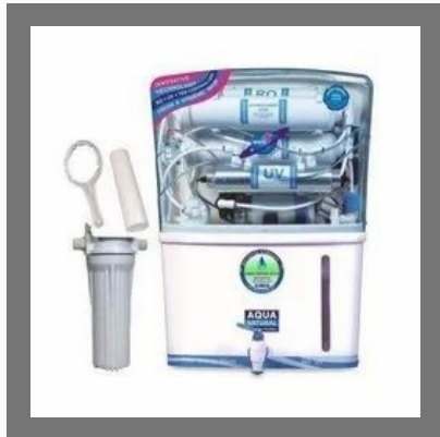
Aqua Grand Plus RO+UV+TDS Control Water Purifier