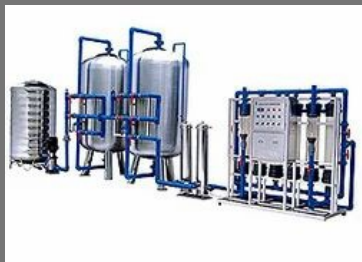
High Capacity RO Plant