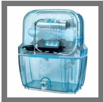
Domestic RO System