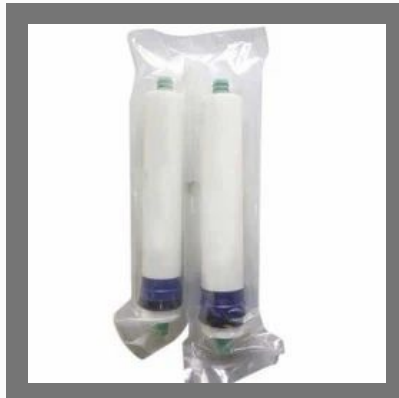
Reverse Osmosis Membrane