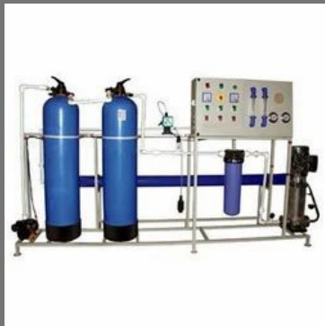
Water Purification RO Plant