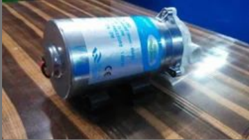
Multipure 100 Gpd Pump