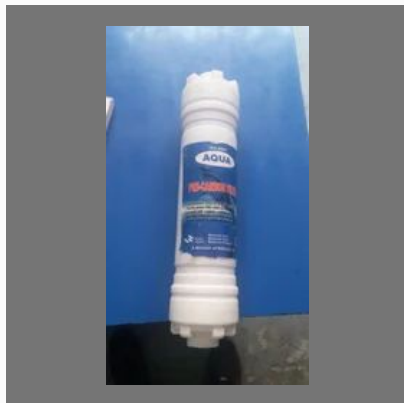
Inline Carbon Filter - Aqua