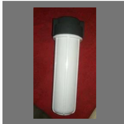
Classic Boul - RO Part