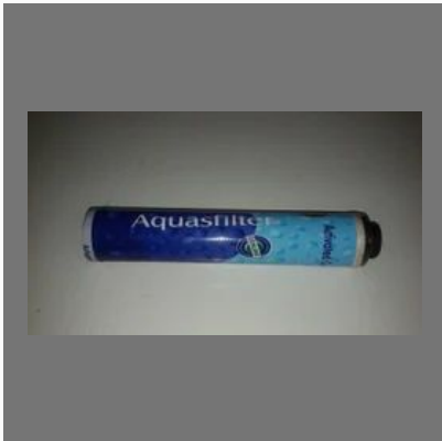
St Carbon Block