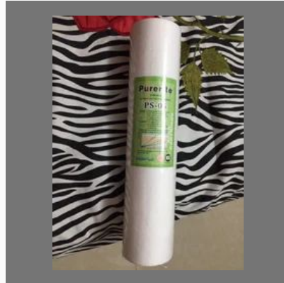
RO Spun Filter