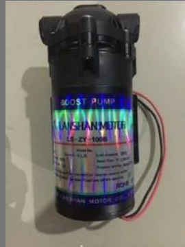
RO Booster Pump