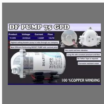
Dow Flow RO Pump