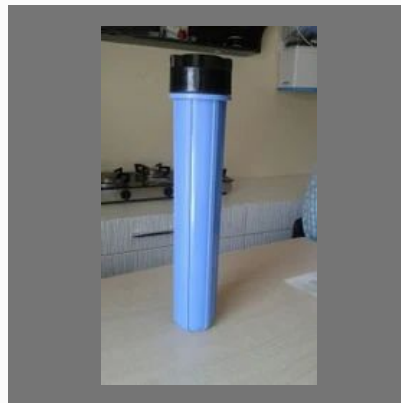
20 Filter Hosing