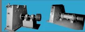
Bearing Units Assembly