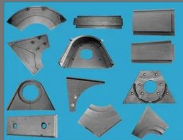
Wheel Housing Liners