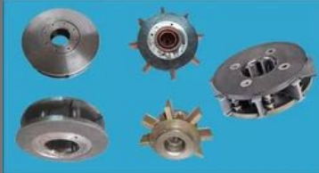
Turbine Wheels / Blast Wheels