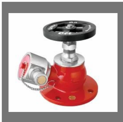
Gun Metal Single Landing Valve