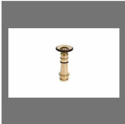
Triple Purpose Nozzle