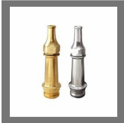
Branch Pipe and Nozzles