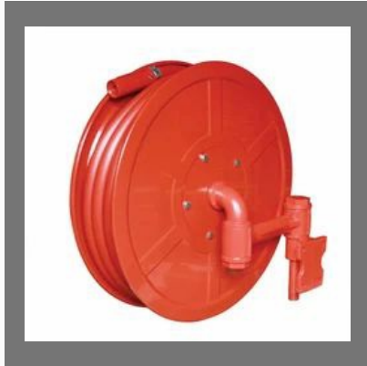
First Aid Hose Reel