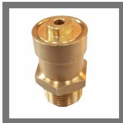
Air Release Valve