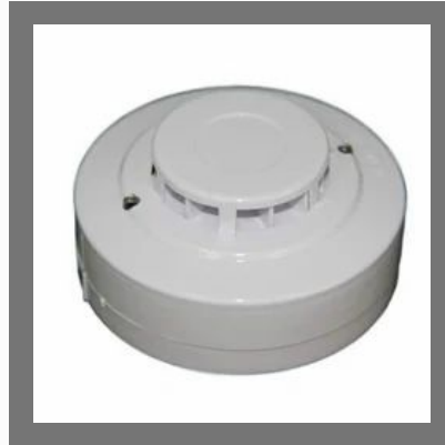
Photoelectric Smoke Detector