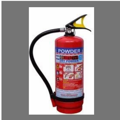
ABC Type Fire Extinguishers