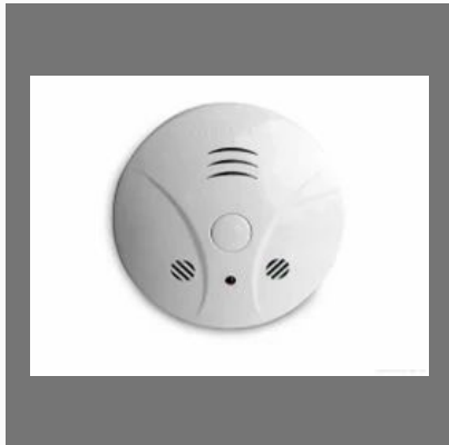
Battery Operated Smoke Detector