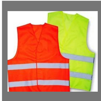
Fire Safety Reflective Jackets