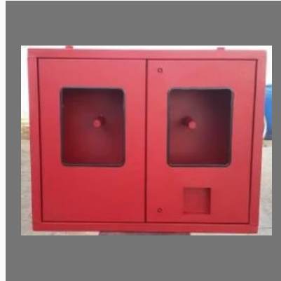
Fire Hose Box