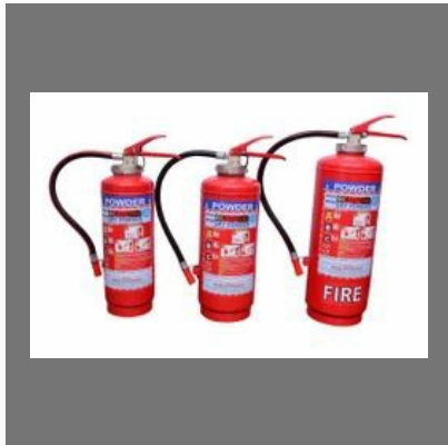
DCP Type Fire Extinguishers