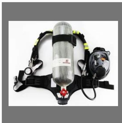
Fire Safety Breathing Apparatus Firefighting