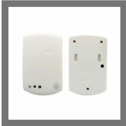
Gas Leak Detector