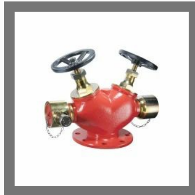
Double Outlet Landing Valve