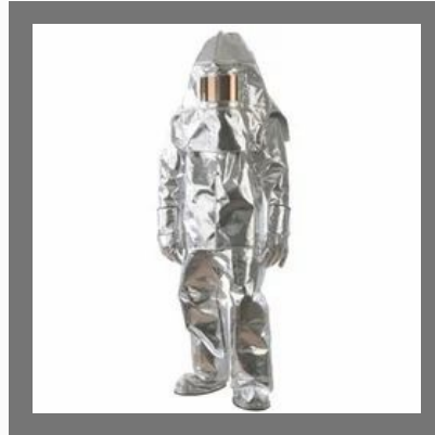
Fire Safety Entry Suit