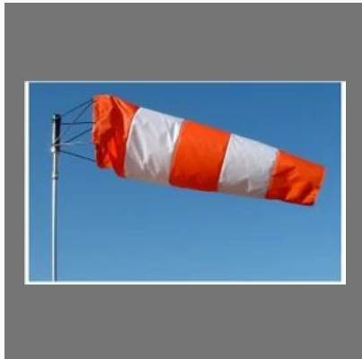
Fire Safety Windsack