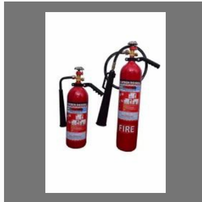
CO2 Type Fire Extinguishers