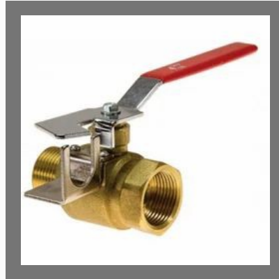
Shut Up Nozzle