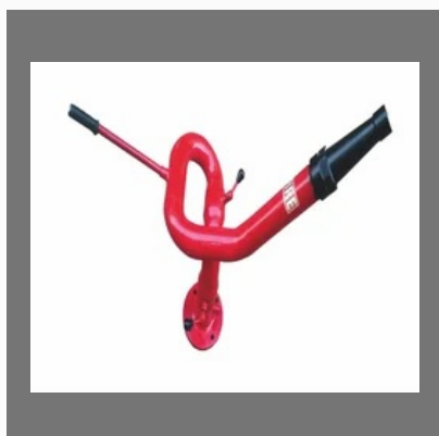
Stand Post Type Water Monitor