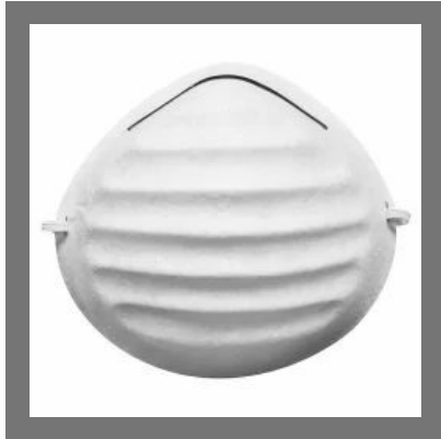
Fire Safety Dust Mask