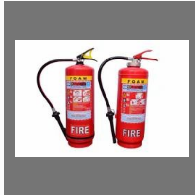
M Foam Type Fire Extinguishers