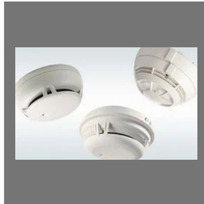
Fire Detection System