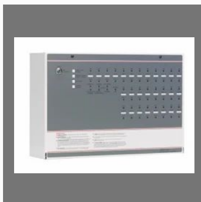
Conventional Panel Fire Alarm