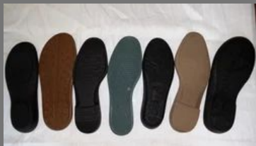
PU Shoe Sole