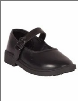
Childrens School Shoe