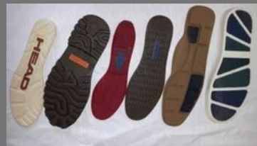
Rubber Shoe Sole