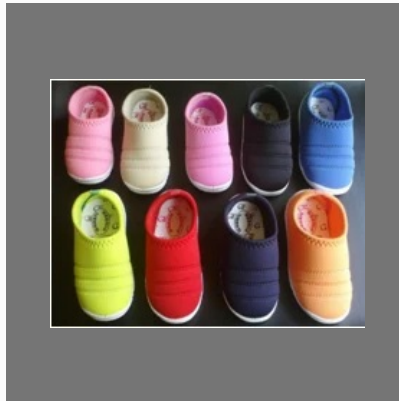
Children Soft Shoe