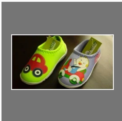
Childrens Soft Shoe