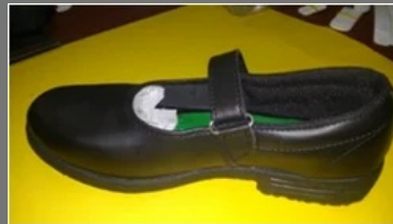
Childrens School Shoe