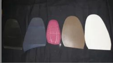
Rubber Fore Parts