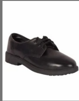
Childrens School Shoe