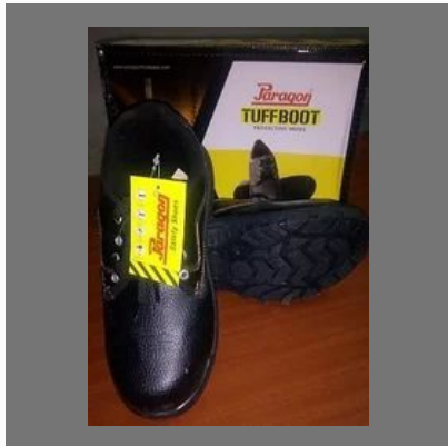
Paragon Safety Shoes