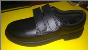
Childrens School Shoe