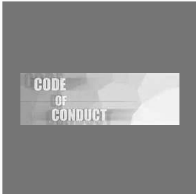
Code Of Conduct For Director & Senior Management