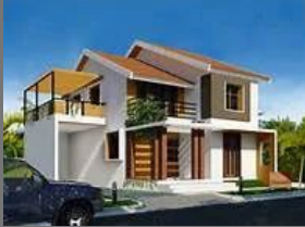
Townships Group Housing Real Estate Services