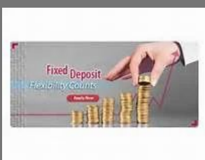
Fix Deposit Scheme