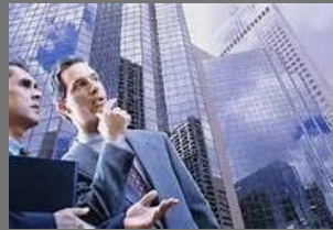
Commercial Real Estate Service