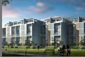
Independent Floors Real Estate Services