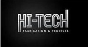
Turnkey Hi-Tech Projects