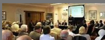
Past Annual General Meeting