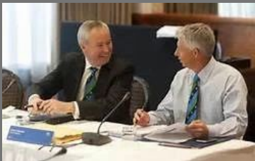
Outcome Of Board Meeting