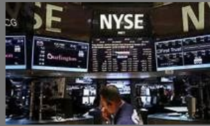
Stock Exchange Listing