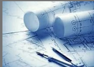
Design, Engineering & Consultancy