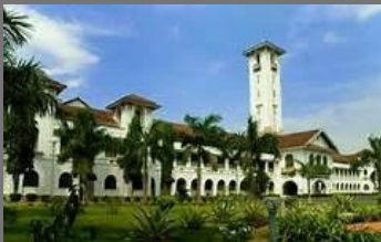
Environmental Upgradation Real Estate Services