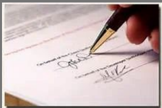
Civil Construction Contractors