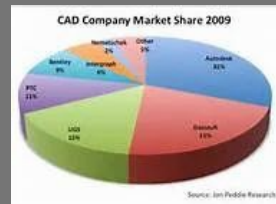
Market Price Of Shares