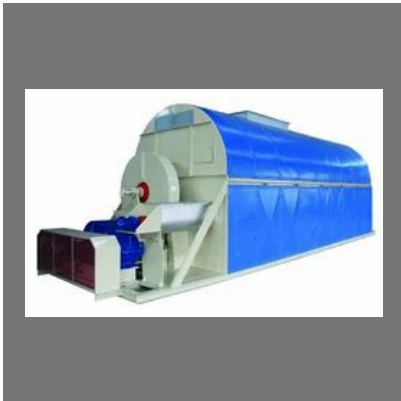
Tube Bundle Dryer