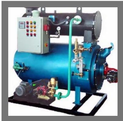
Gas Fuel Fired Boiler