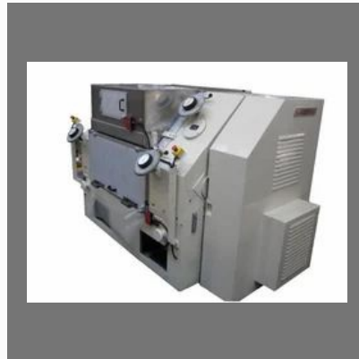
Roll Milling Machine