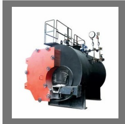
Solid Fuel Fired Boiler