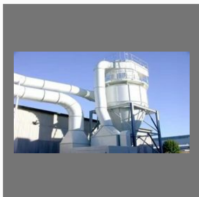
Pneumatic Conveying System