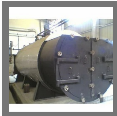
Waste Heat Recovery Boiler