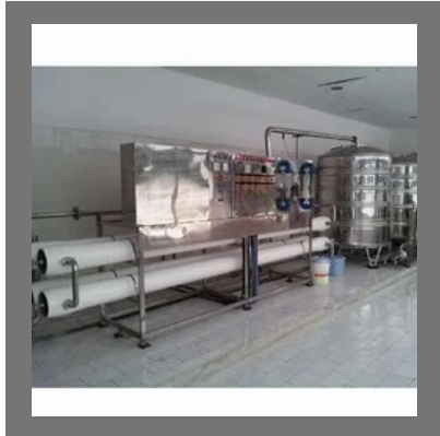
Fruit Juice Plant