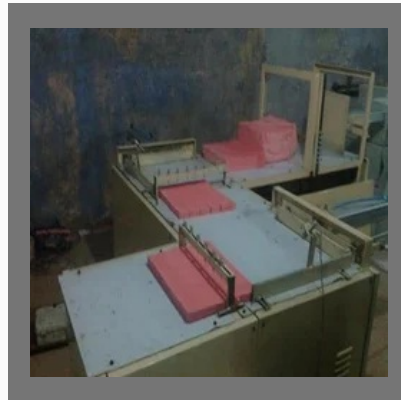
Soap Cutting Machine