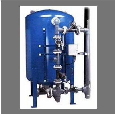
Activated Carbon Filter