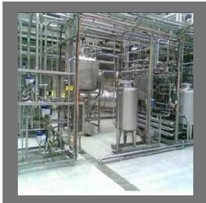
Milk Processing Plant