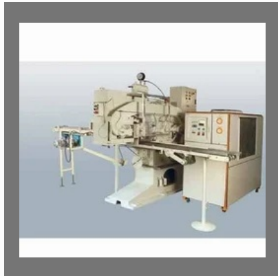
Soap Finishing Line Machine