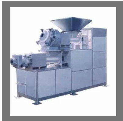
Soap Duplex Plodder