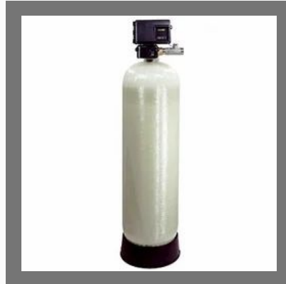
Multimedia Water Filter