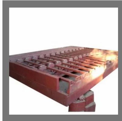
Dumping Grate Boiler