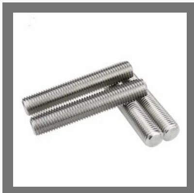
Stainless Steel Stud