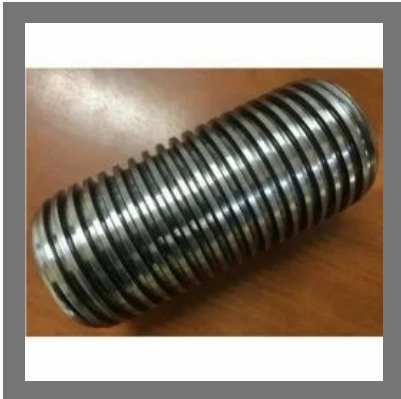
Studs 100 Dia