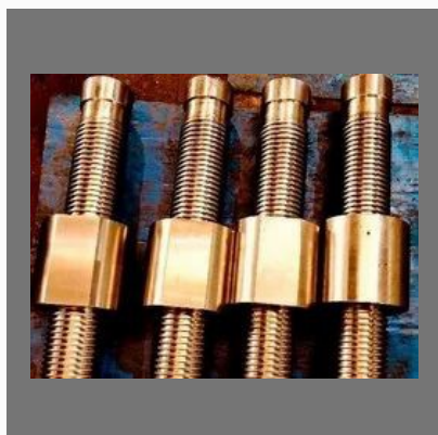
Lead Screw with Nut (Dia 150 & 50 mm Pitch )