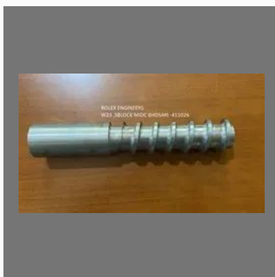
Profile Threading 25 Mm Pitch