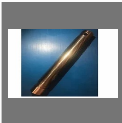
10mm Lead Screw