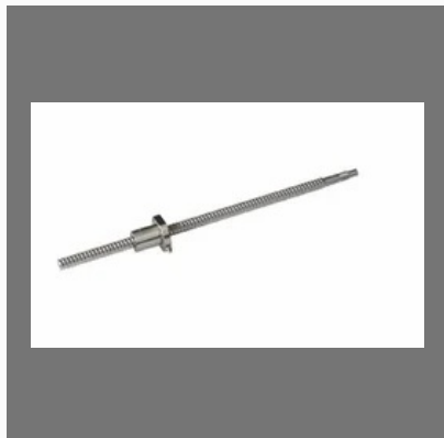
Spindle Screw with Nut