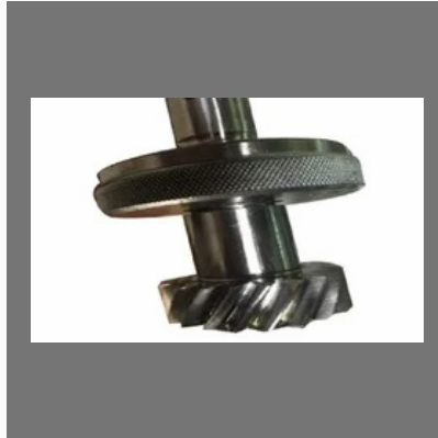
Spline Rolling Shaft