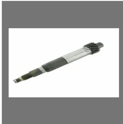
Gear Box Shaft