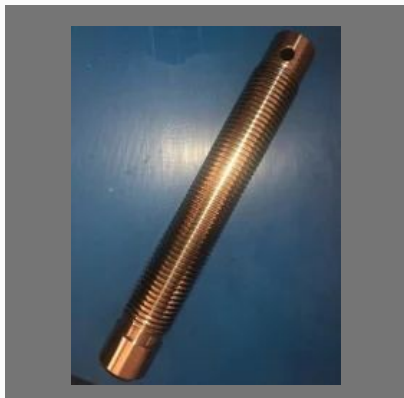
Threaded Bars (Threaded Rod )