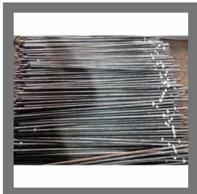
Brace Rods (MS & SS)