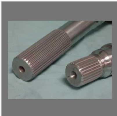
Spline Rolling ( upto 80 mm )