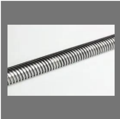
Lead Screws 100 mm dia