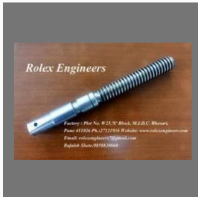
Gate Valve Stems