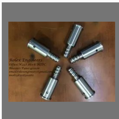
Special Threading Shaft