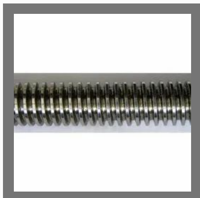
3 Start Threading Shaft