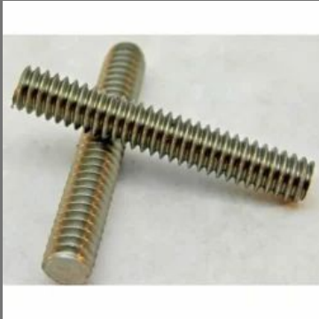
Acme Threaded Screw