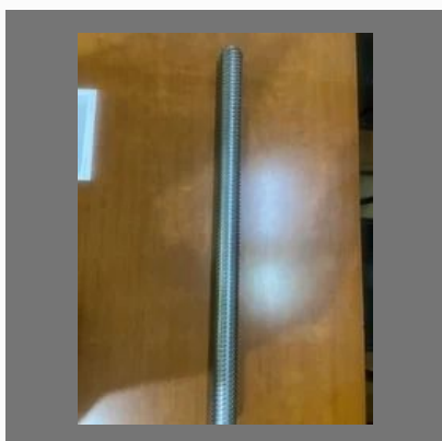
Variable Pitch Threading