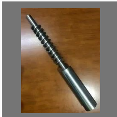
Extrusion Screw MS