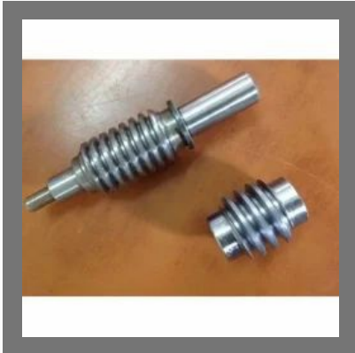
Gear Worm Shaft