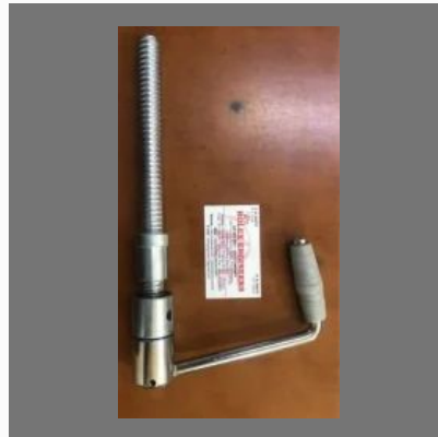
Hospital Bed Screw Handles