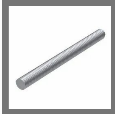
Trapezoidal Lead Screw