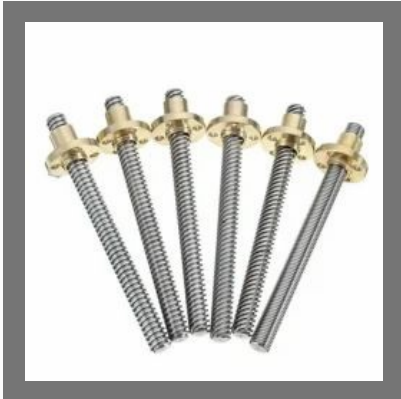
Rolex Leadscrew / Printer Leadscrews