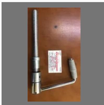
Hospital Bed Screw