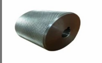
Diamond Knurling All Type