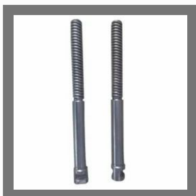
Gate Valve Stem