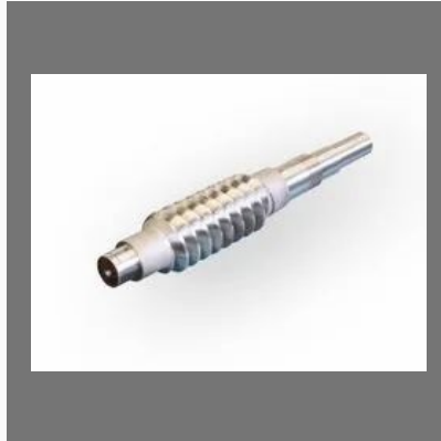
Worm Shaft SS MS