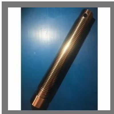
Thread Rolling Screws