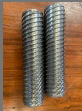
Leadscrew & Nut