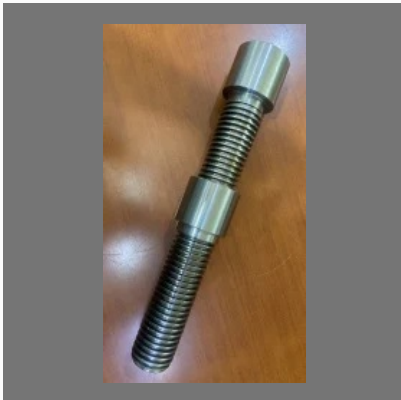
Multistart Screws Or Leadscrews