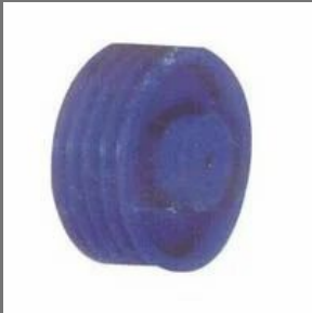
Plate Type Pulley