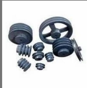
Cast Iron Pulley