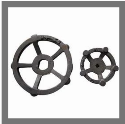
Hand Wheel Castings