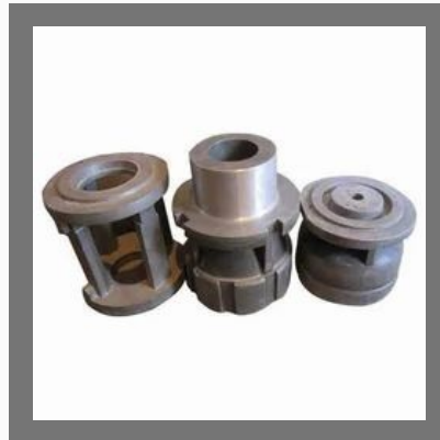
Submersible Pump Castings