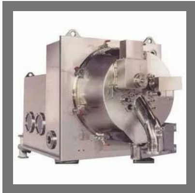
Peeler Centrifuge Machine