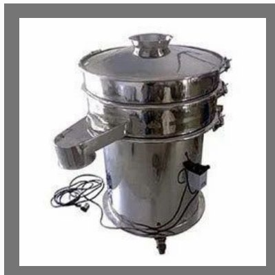
Pharma Vibro Shifter