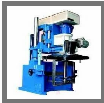
Chemical Process Equipment