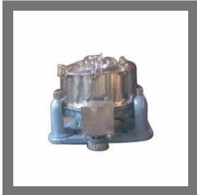
Bottom Discharge Centrifuge Machine