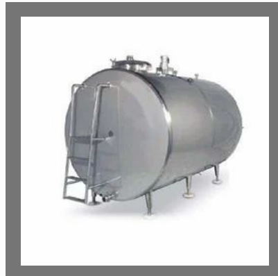
Road Milk Storage Tank