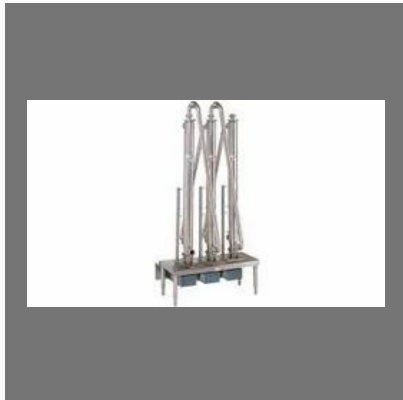
Scraped Surface Heat Exchanger