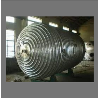
Limpet Coil Reaction Vessel