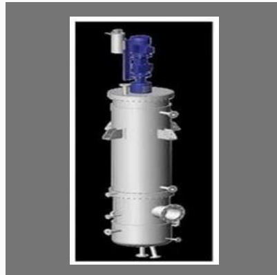
Scraped Surface Evaporator