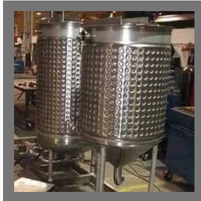
Jacketed Process Vessel