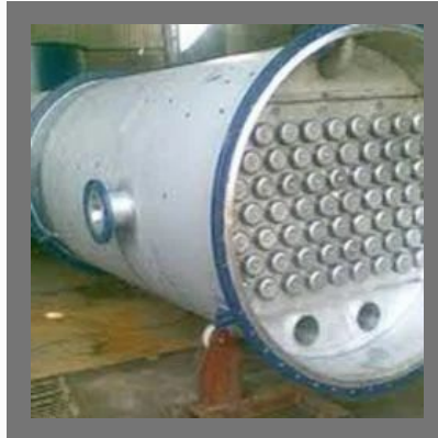
Bubble Cap Tray Column