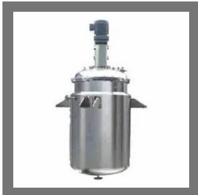
Stainless Steel Tank