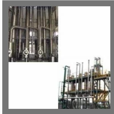
Forced Circulation Evaporator