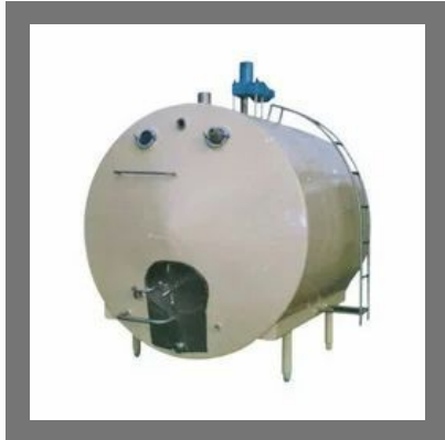
Horizontal Milk Storage Tank