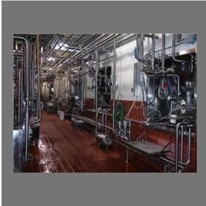
Piping with Orbital Welding