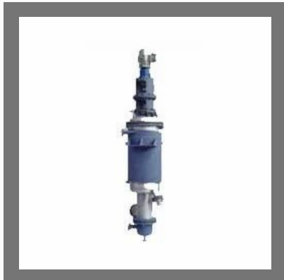
Agitated Thin Film Evaporator