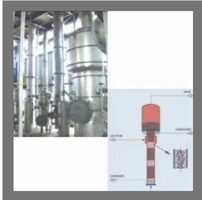
Rising Film Evaporator