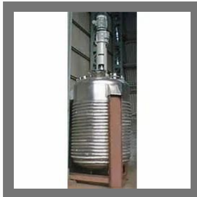
Agitator Reaction Vessel