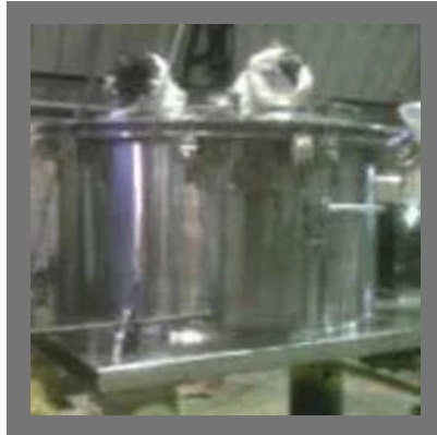
Bag Lifting Top Discharge Centrifuge Machine