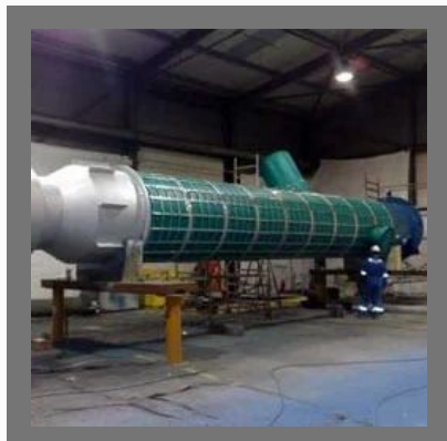
Chemical Reactor Vessel