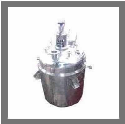
Jacketed Reaction Vessel