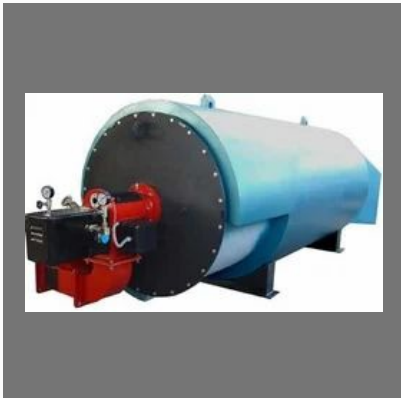
Hot Air Generator