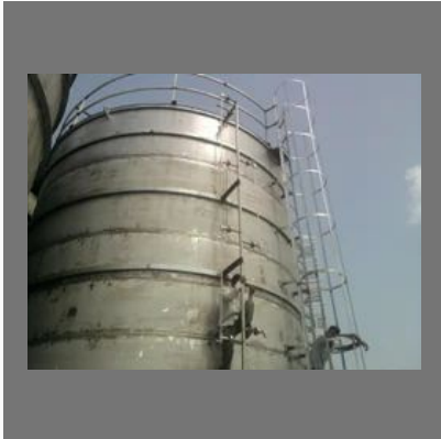
Chemical Storage Tank