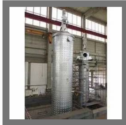
Thin Film Evaporator