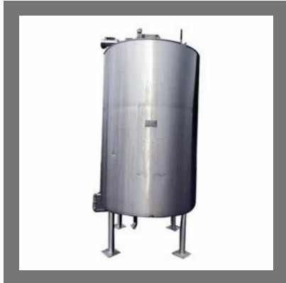
Pulp Storage Tank