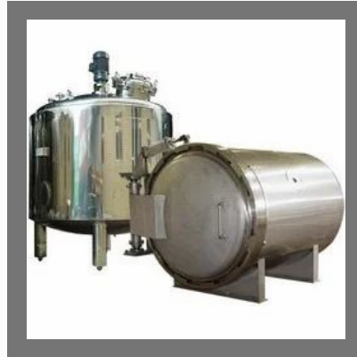
Pharma Pressure Vessel