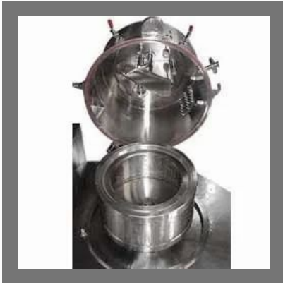
Pharma Centrifuge Machine