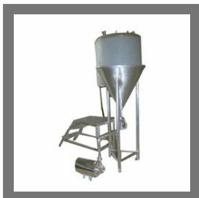
Butter Milk Tank