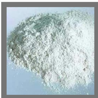
Beclomethasone Dipropionate IP/BP