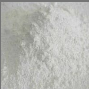
Norethisterone Acetate IP/BP