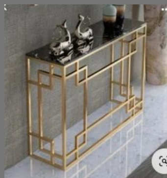
Fancy Console Table