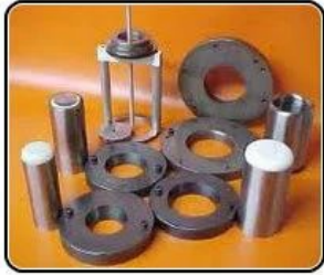
Job Work For Deep Draw Dies