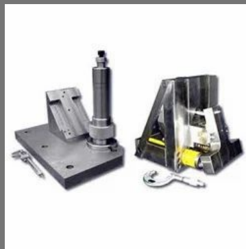
Job Work For Jigs & Fixtures