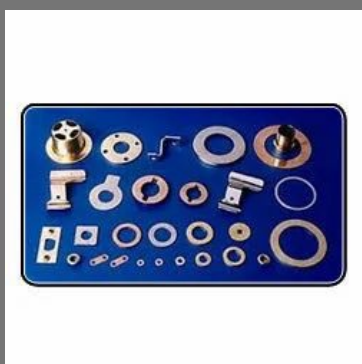
Job Work For Sheet Metal Components Dies