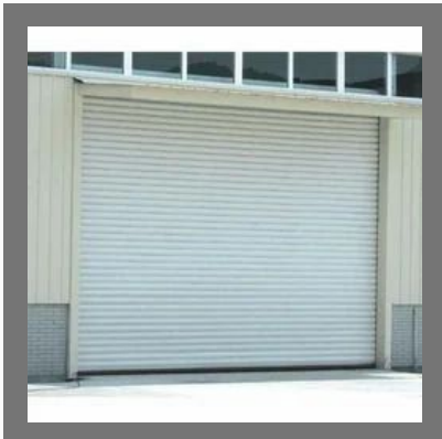
Shop Rolling Shutters