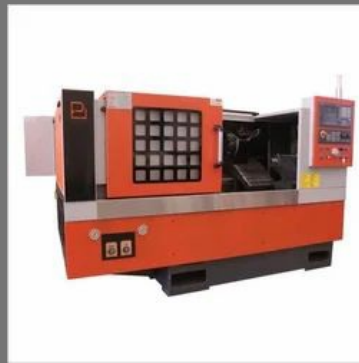
Cnc Lathe Job Work