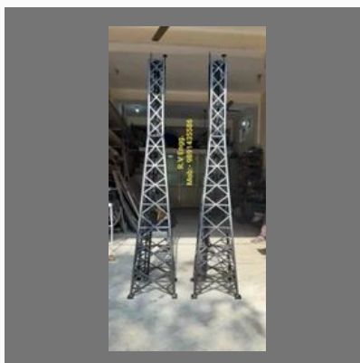
MOBILE TOWER MODEL