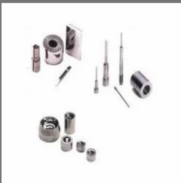
Job Work For Typical Dies