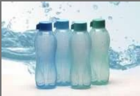
Aquasafe Bottle 1L