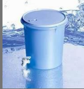
Water Dispenser Round