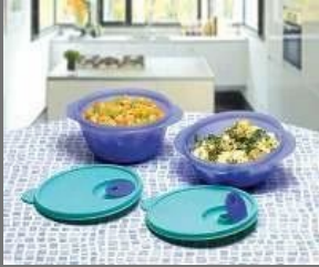
Crystal Wave Bowl