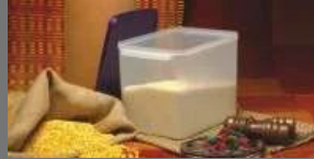
Store It All