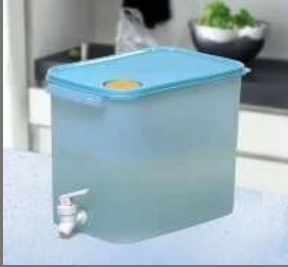
Rectangular Water Dispenser