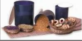
One Touch Canister