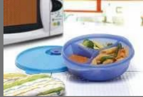
CrystalWave Divided Bowl