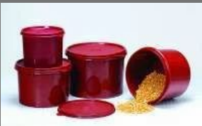
Store All Canister