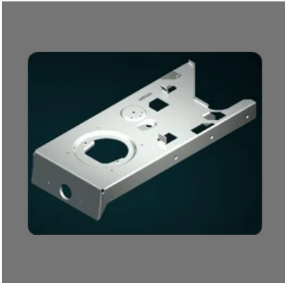
Sheet Metal Parts & Assemblies