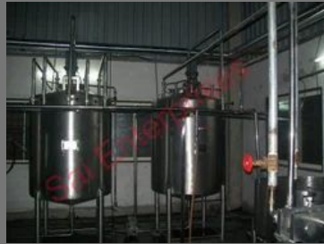
Juice Processing Plant