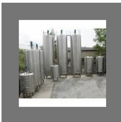
VMST Milk Storage Tank