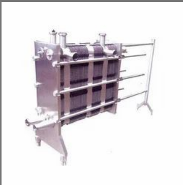
Industrial Plate Heat Exchangers