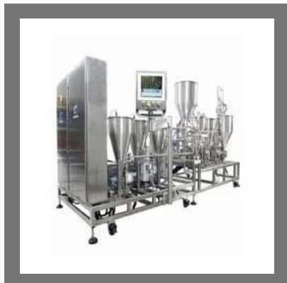
Beverage Blending System