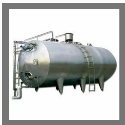
HMST Milk Storage Tank