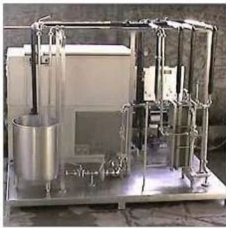
Mini Dairy Plants