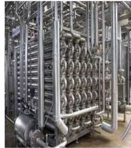
Tubular Heat Exchanger