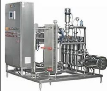
Ready Beverage System