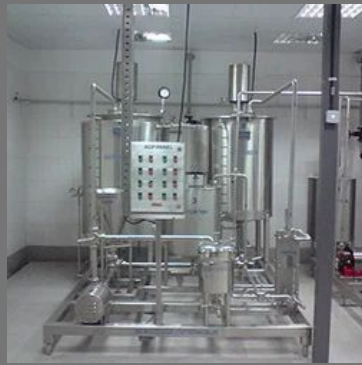
RTS Preparation And Storage Plant