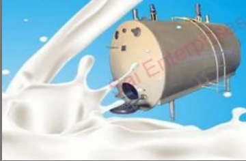
Milk Storage Tank