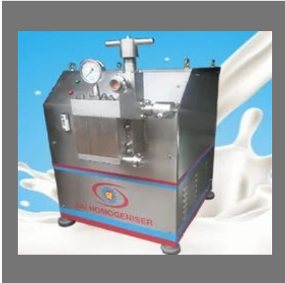
High Pressure Milk Homogenizer