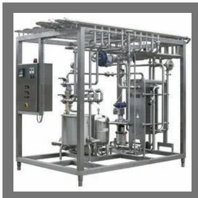
Optimized HTST Pasteurization Plants