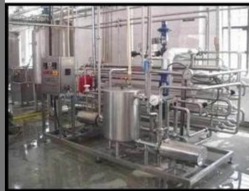
Steam Tubular Heat Exchangers