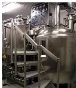
Semi Automatic Multi Tank CIP System