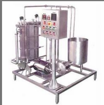
Industrial Dairy Plant Equipment