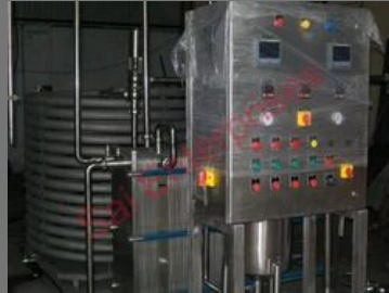
Curd And Paneer Plant