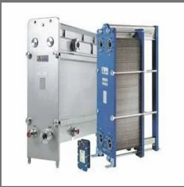
Plate Type Heat Exchanger