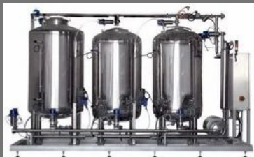
Automatic Multi Tank CIP System