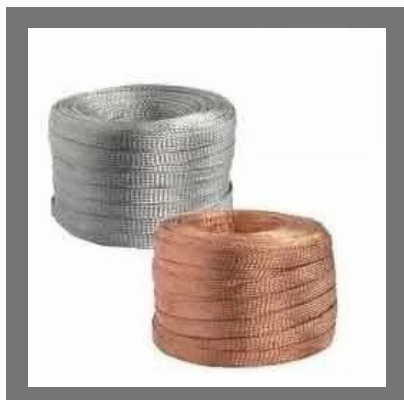
Flexible Braided Copper Wires