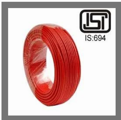
PVC Insulated Domestic Wire