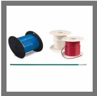
PTFE Hook Up Wire