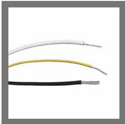
PTFE Equipment Wire