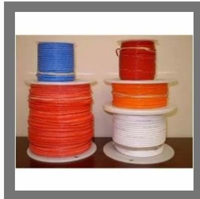
PTFE Corona Resistance Cable