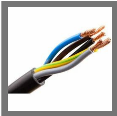
5 Core Multicore Cable