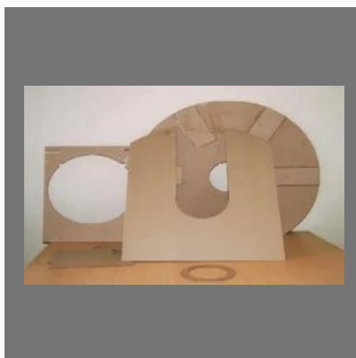
Pre Compressed Board Part