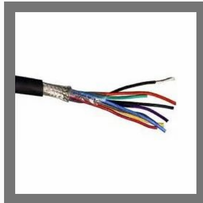
PTFE Multicore Wire