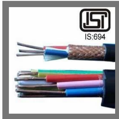
Copper Control Cable