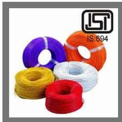
PVC FRLS Special Purpose Wire