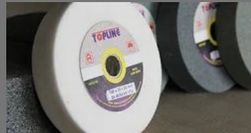
Offhand Grinding Wheel