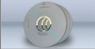
Crankshaft Grinding Wheels