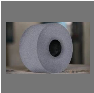
Cylindrical Grinding Wheel