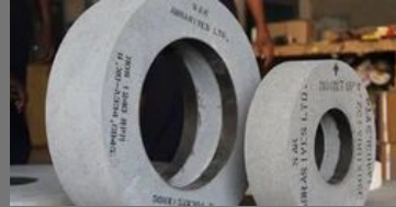
Centreless Grinding Wheel