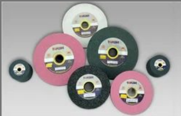
Tool Room Grinding Wheel