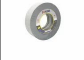
Centerless Grinding Wheel