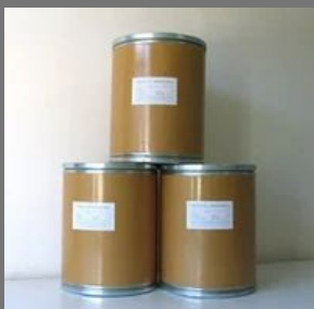
Dexamethasone Sodium Phosphate