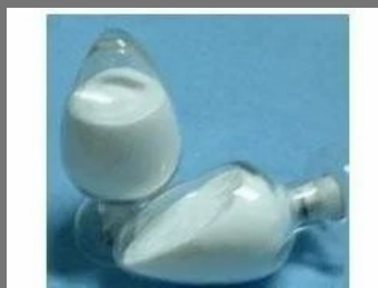
16 Beta- Methyl Epoxide (DB-11)