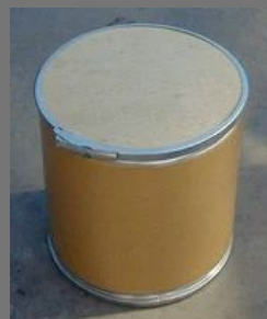
Betamethasone Di Propionate