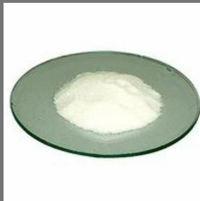
Prednisolone Sodium Phosphate