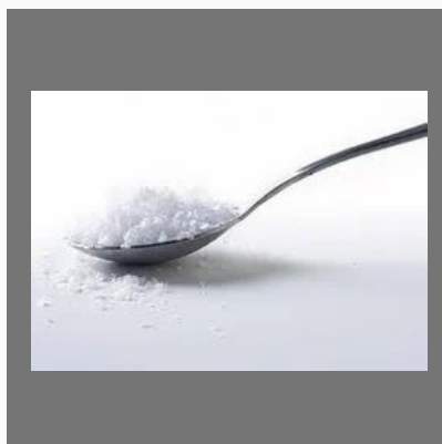
Monosodium Glutamate 30 Mesh