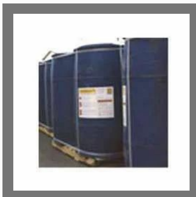
Nonyl Phenol Ethoxylate 9.5 Mol