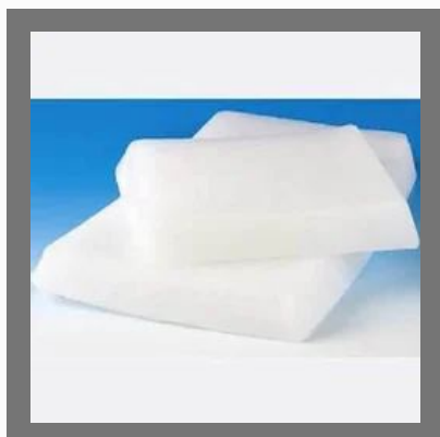
Semi Refined Paraffin Wax