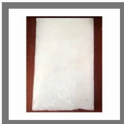
Fully Refined Paraffin Wax