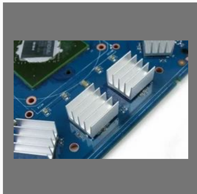
Aluminum Heat Sinks