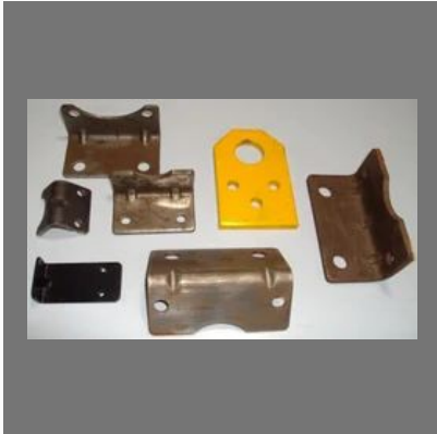
Precision Mild Steel Brackets