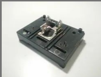
Electrical Sheet Metal Components