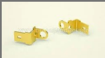
Brass Electrical Sheet Metal Components