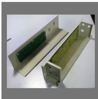
Mild Steel (M.S.) Boxes