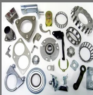
Sheet Metal Stampings