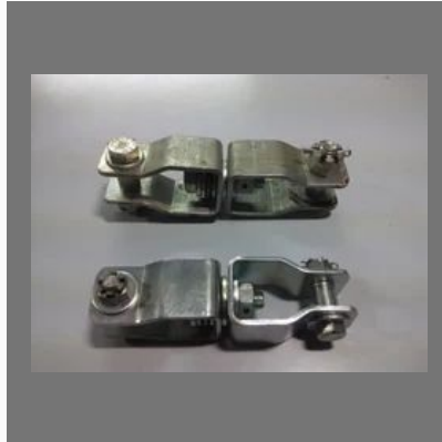
Metal Bracket Assemblies