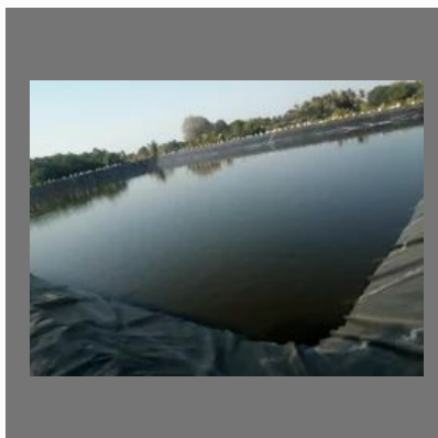
HDPE Pond Liner 500 Micron ISI