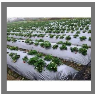
Mulching Film 30 Micron