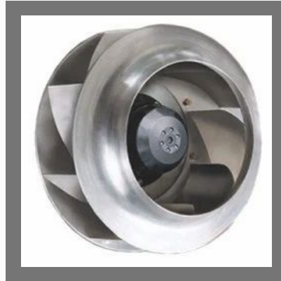
ID Fan Impeller