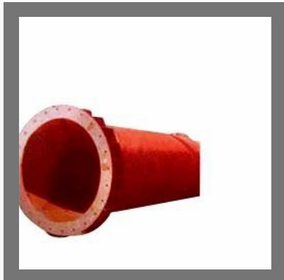
Self Supported Chimney