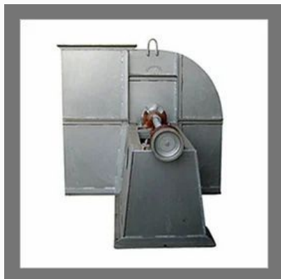
ID Fan (Backside)