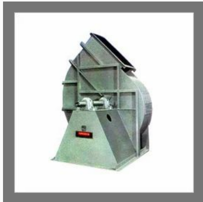
Boiler ID Fan