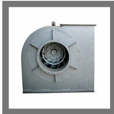
ID Fan (Front Side)