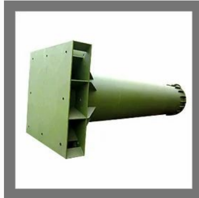
Self Supported Chimneys