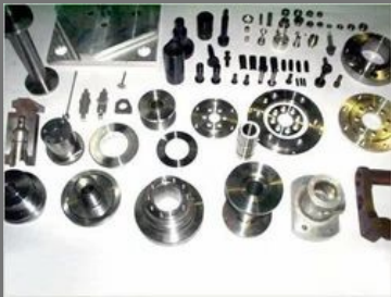
Precision Turned Component