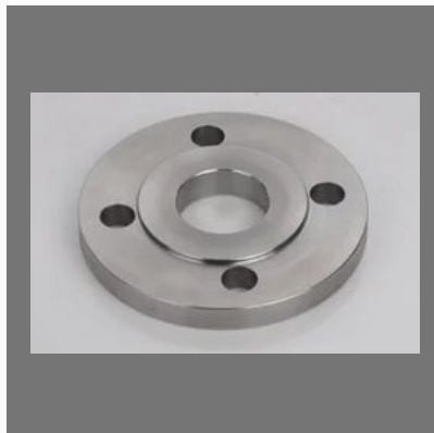
Stainless Steel Flange