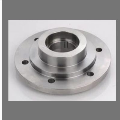
SS Pipe Flange