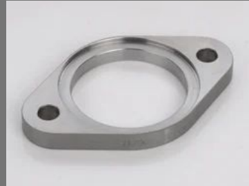
Silencer End Plate