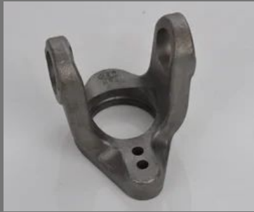
Heavy Duty Half Yoke