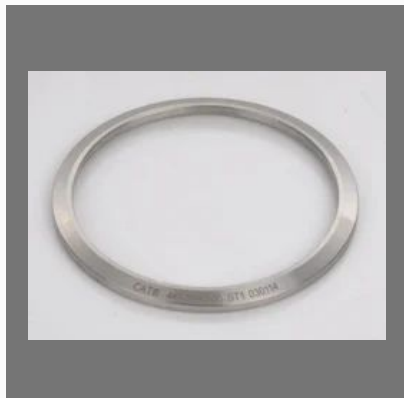
SS Trim Ring