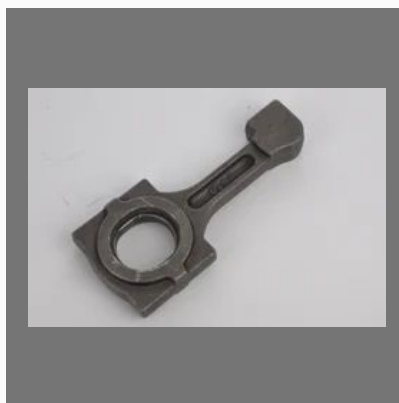
Engine Connecting Rod