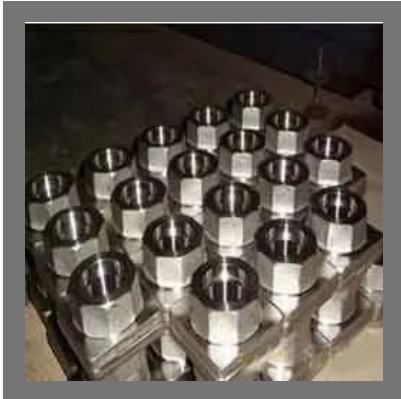
Steel Pipe Flange