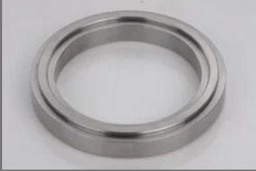
Stainless Steel Ring