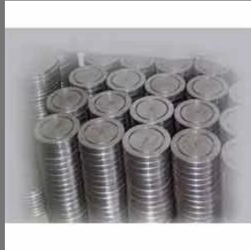
Stainless Steel Plate Flange