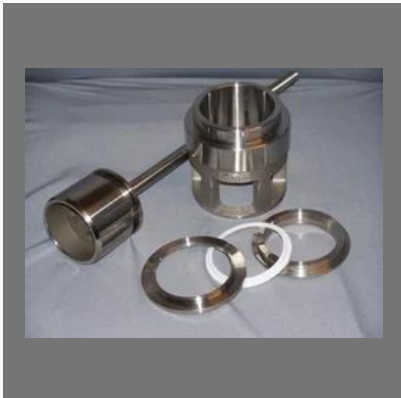
Control Valve Body