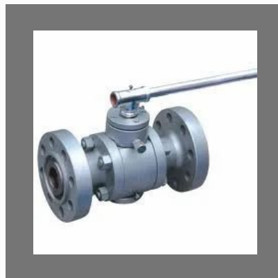
Forged Ball Valve