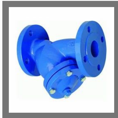
Cast Iron Butterfly Valve