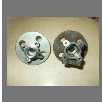
Globe Valve Body