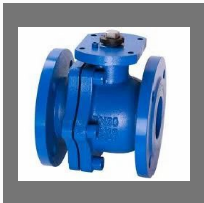
Cast Iron Ball Valve