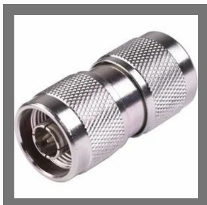
Male to Male Adapter