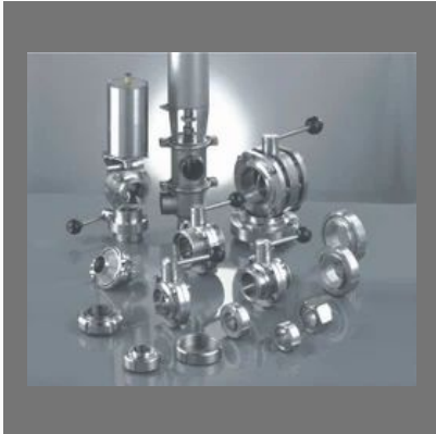
Stainless Steel Valve Body