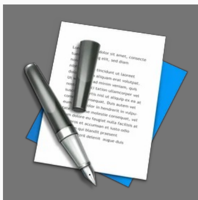
Project Management Service