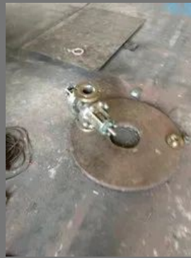
Air Lock Valves