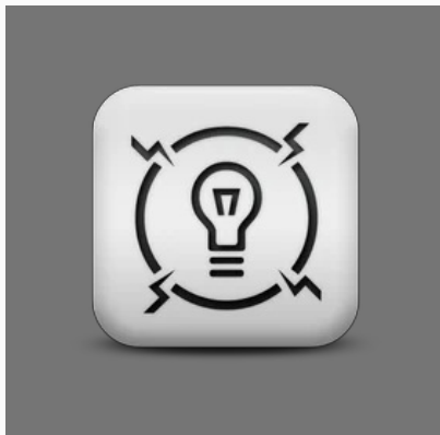
Electrical Design & Installation Service