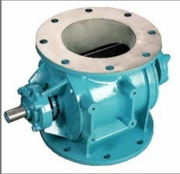
Knife Edge Slide Gate Valve