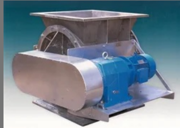
Easy Clean Rotary Feeder