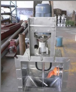
Blow thru Rotary Airlock Feeder