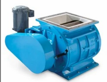
Rotary Air Lock Feeders