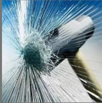
Safety And Security Film