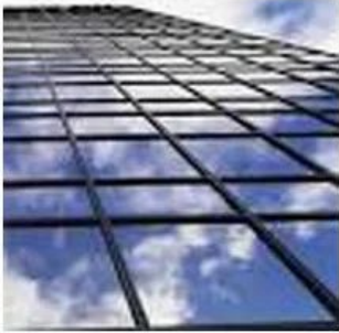
Solar Control Film