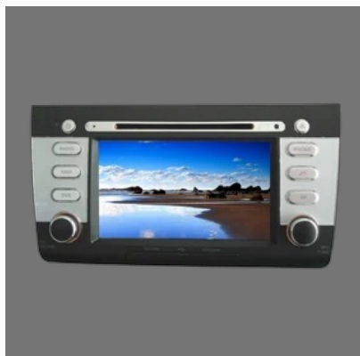
Suzuki Swift 2010 Car Multimedia Navigation System