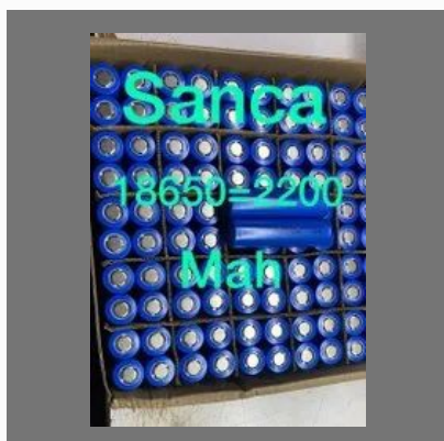
Lithium ion Battery Cell