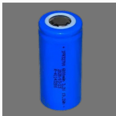
Lifepo4 Cell 3.2v 6ah