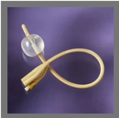
Foley Balloon Catheter