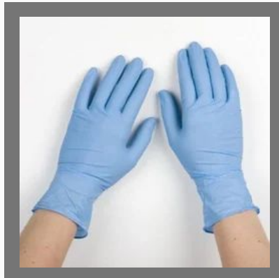
Examination Rubber Gloves