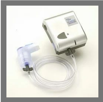
Electro Medical Products