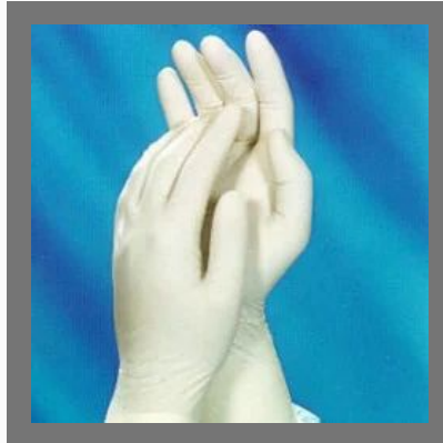
Surgical Rubber Gloves