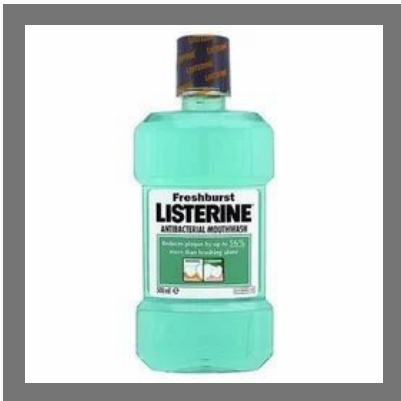
Mouthwash And Mouth Rinse