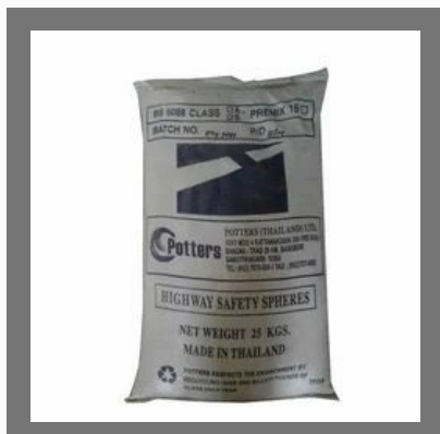
Drop On Glass Beads