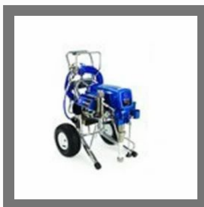
Graco Automatic Machine