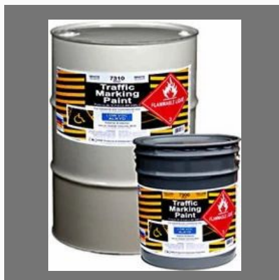
Traffic Marking Paint