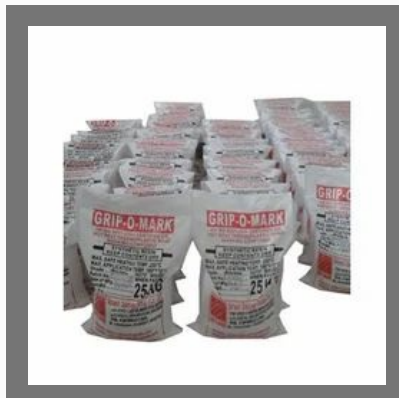
Thermoplastic Road Marking Paint Brand Name: GRIP-O- MARK