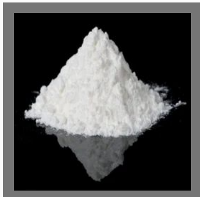
Titanium Dioxide (TiO 2 ) (RUTILE & ANATESE GRADE)