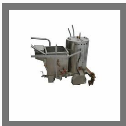
Thermoplastic Road Marking Machines