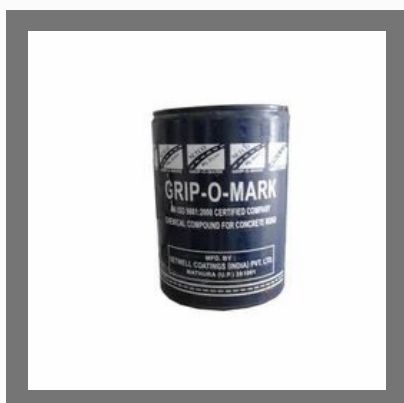
Adhesive Compound For PQC Roads