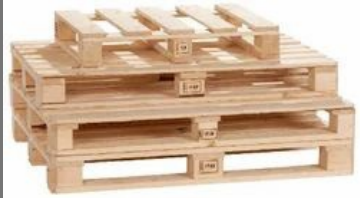
Heat Treated Wooden Pallets