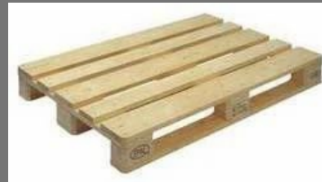
Pine Wood Pallets