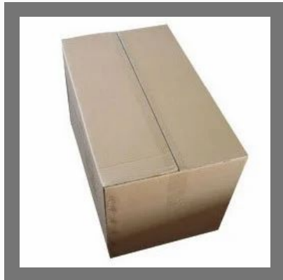
Wooden Boxes/Corrugated Boxes