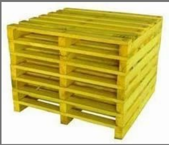
Fumigated Wooden Pallets