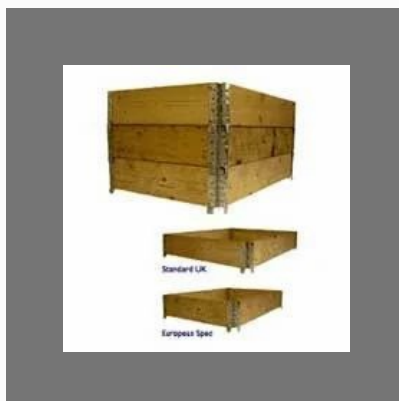
Wooden Pallet Collars