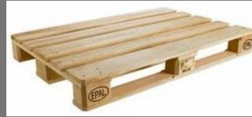
Wooden Euro Pallets