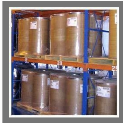
Wooden Drums/Ply Boxes