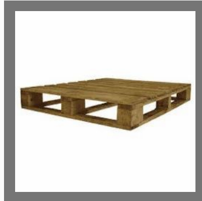
Chemical Spec Pallets