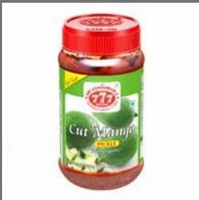
777 Cutmango Pickle