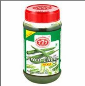
777 Green Chilly Pickle