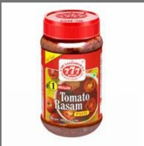
777 One Minute Tomato Rasam Paste 300g Pet Jar