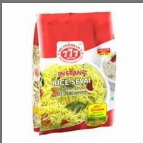
777 Short Cut Vermicelli (Semia)