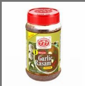
777 Instant Garlic Rasam Paste 300g Pet Jar