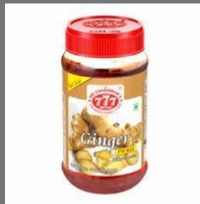
777 Ginger Pickle 300g Pet Jar