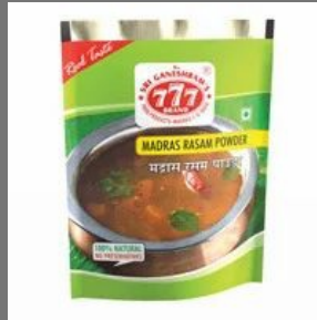
Madras Rasam Powder