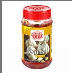
777 Garlic Pickle