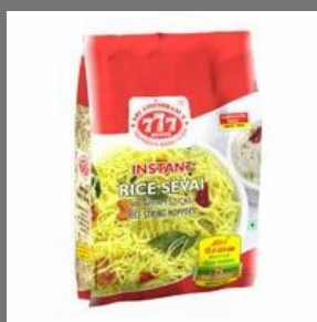
777 Instant Rice Sevai