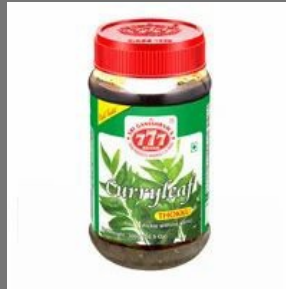
777 Curryleaf Thokku Pickle