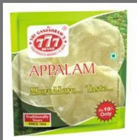
777 Appalam Rs.10