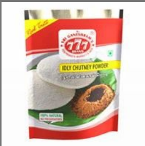
777 Idly Chutney Powder