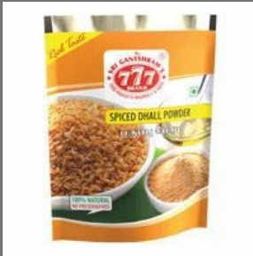
Spiced Dhall Powder