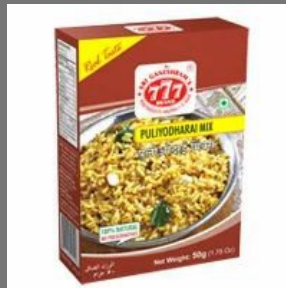
Madras Puliyocharai powder