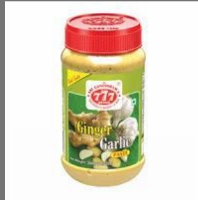
777 Instant Ginger Garlic Paste 300g Pet Jar