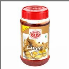
777 Ginger Pickle