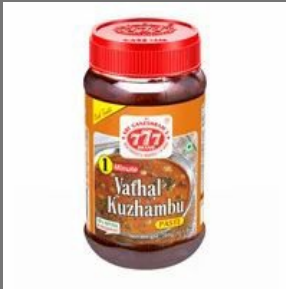
777 Instant Vathal Kuzhambu Paste 300g Pet Jar