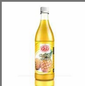
Pine Apple Squash