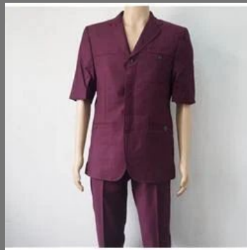
Designer Safari Suit