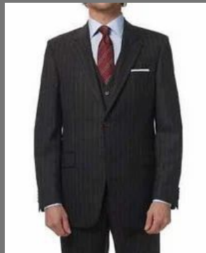
Mens Single Breasted Suit