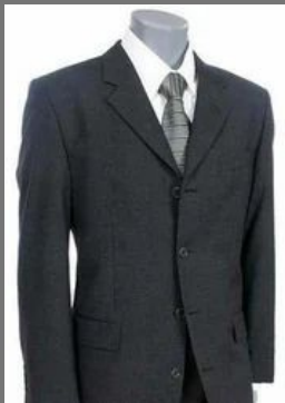
Mens Four Button Suit