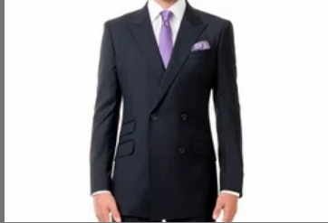
Mens Double Breasted Suit