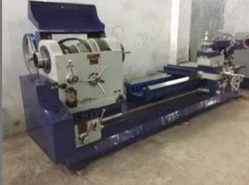
Industrial Heavy Duty Lathe Machine, 3 Inch