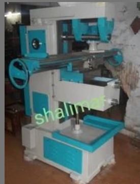
SHALIMAR MILLING MACHINE