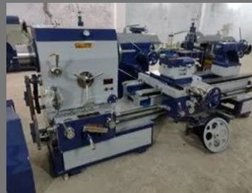
Roll Turning Lathe Machine