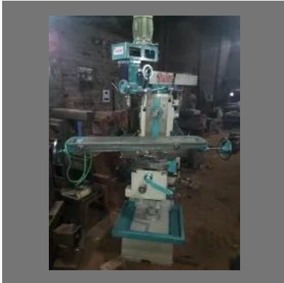
Industries Vertical Milling Machine