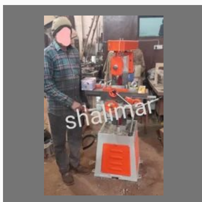
Cricket Bat Scooping Machine