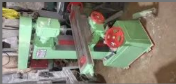
Shaft Keyway Milling Machine