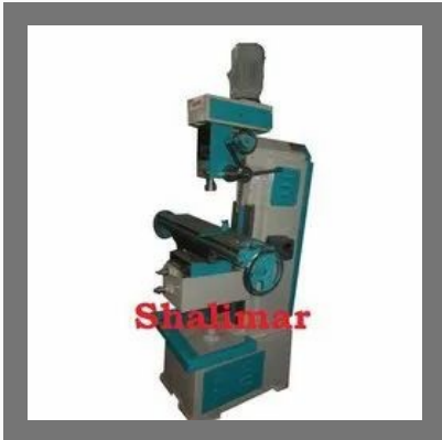
Vertical Milling Machine