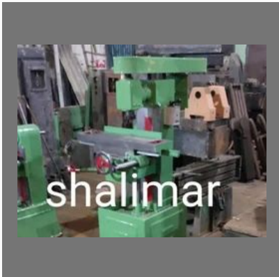
Cricket Bat Scooping Machines