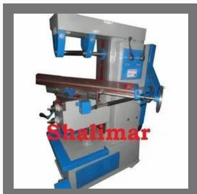
Universal Milling Machine