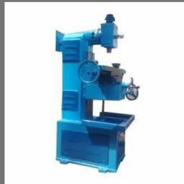
Facing Cutter Vertical Milling Machine