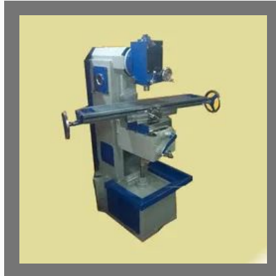
Vertical Milling Machine