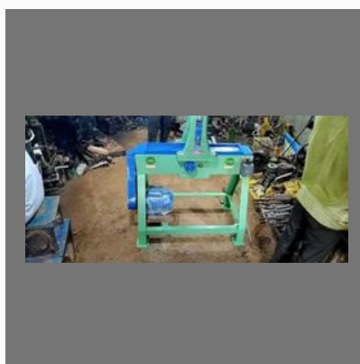
Cricket Bat Pressing Machine