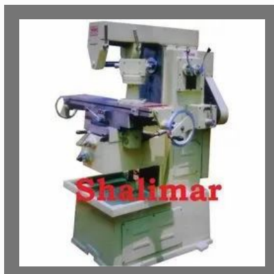
Horizontal Milling Machine