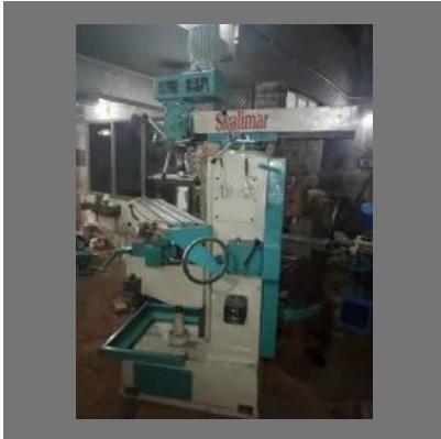
Vertical Turret Milling Machine