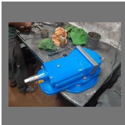
Milling Machine Vice