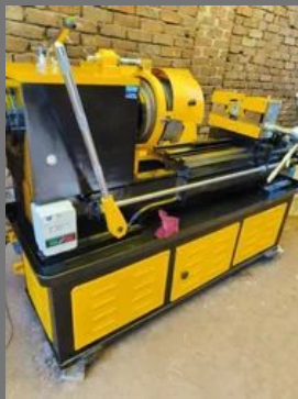
Linco Die Head Machine