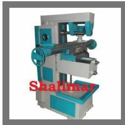
Bed Type Milling Machine