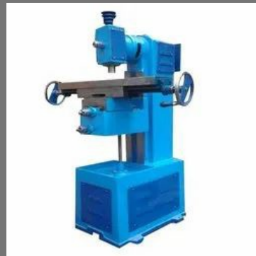
Keyway Milling Machine