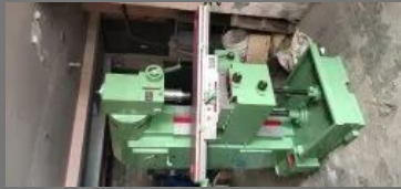
Conventional Vertical Milling Machine