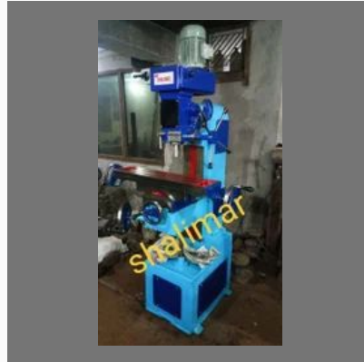
Vertical Drill Head Milling Machine