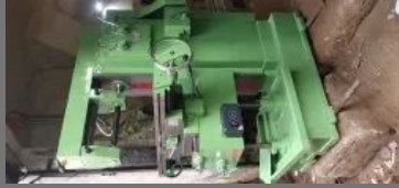
Universal Milling Machine