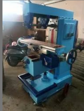
Universal Milling Machine