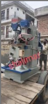
Gang Milling Machine