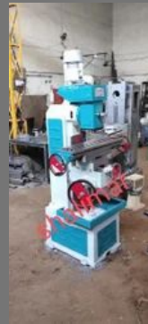
Pipe And Tube Notching Machine