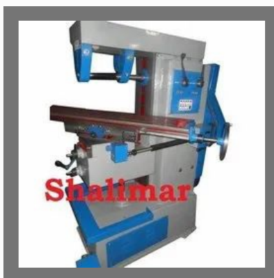
Toolroom Milling Machine