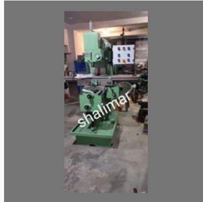
Vertical Iron Milling Machine