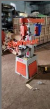
Cricket Bat Slotting Machine