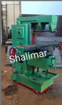
Heavy Duty Milling Machine