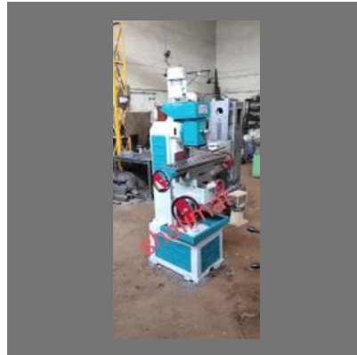
Cycle Frame Cutting Vertical Milling