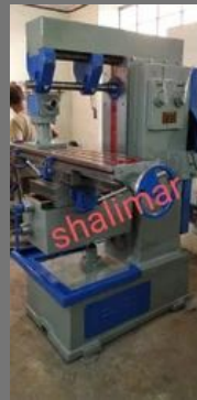
Geared Milling Machines