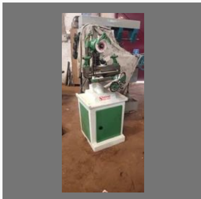
Tool And Cutter Grinding Machine