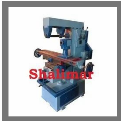
Universal Milling Machines