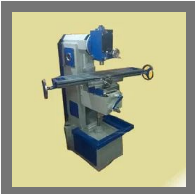
Vertical Gear Head Milling Machine