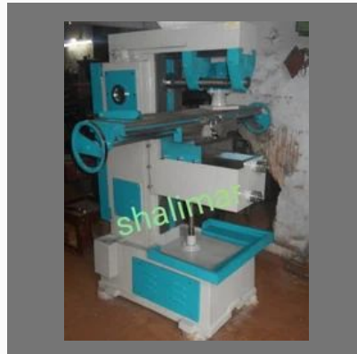
Gear Hobbing Machine