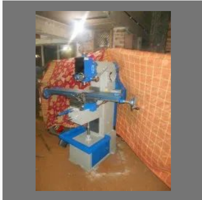
Vertical Milling Machines sfw-VM1