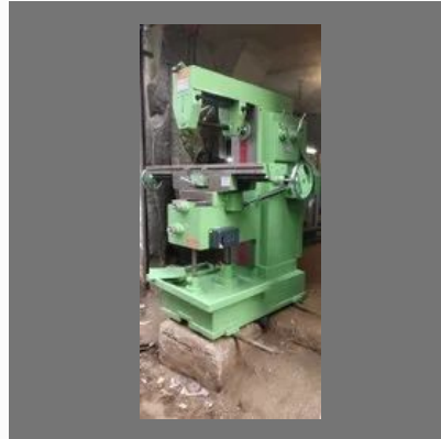
Horizontal Milling Machine