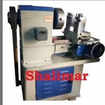
Heavy Duty Lathe Machines