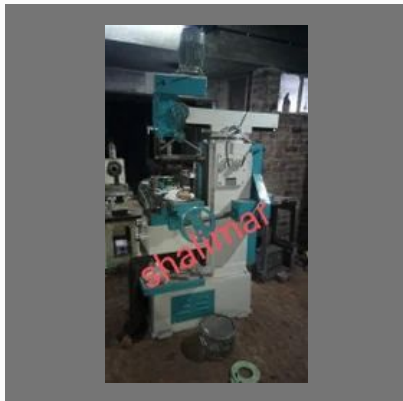
Vertical Milling & Drilling Milling Machine