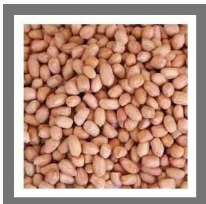
Indian Peanuts (Khari Sing)