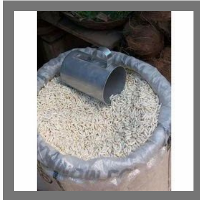
Export Quality Puffed Rice