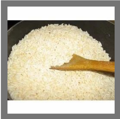
Khar Basmati Rice