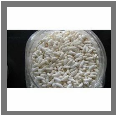
IR Puffed Rice