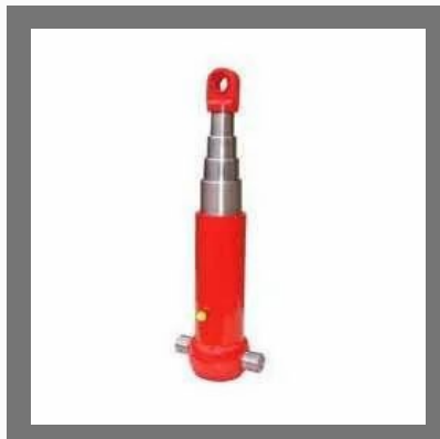
Multi Stage Telescopic Hydraulic Cylinder