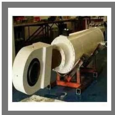
Welded Construction Hydraulic Cylinders