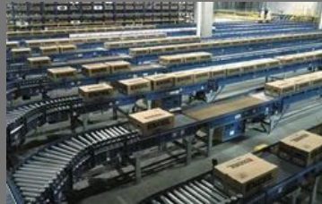
Material Handling System