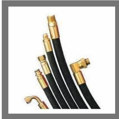
Hydraulics Hose Pipe