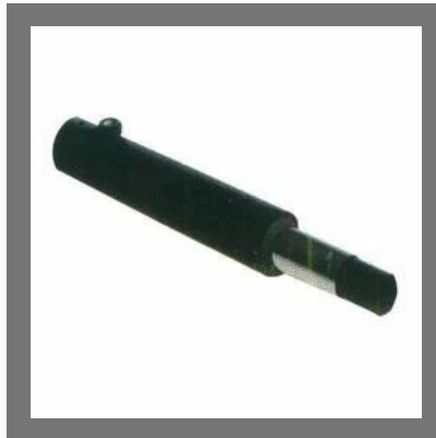
Single Acting Cylinder