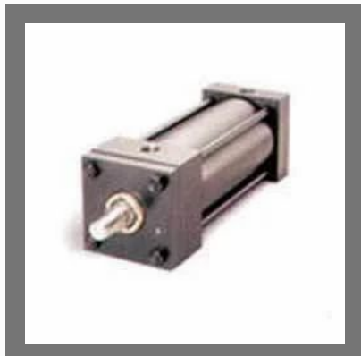
Tie Rod Hydraulic Cylinder