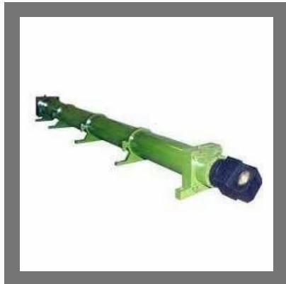
Extra Long Hydraulic Cylinder