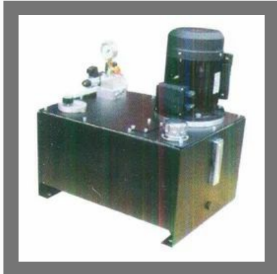
Hydraulics Power Pack