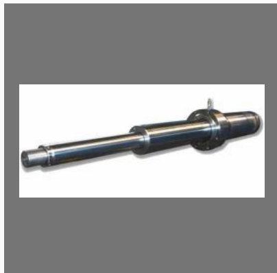
Telescopic Hydraulic Cylinder