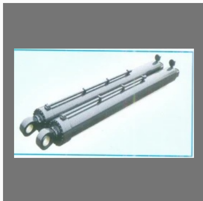
Double Acting Cylinder