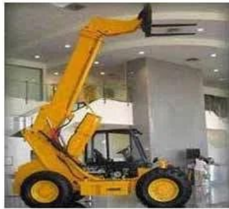
Material Handling Machine