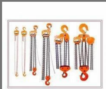
Material Handling Equipments