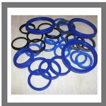
Rubber Hydraulic Seal