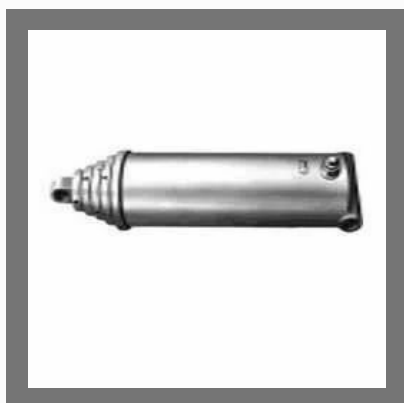
Multi Stage Telescopic Cylinder