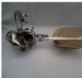
Cup Water Current Meter