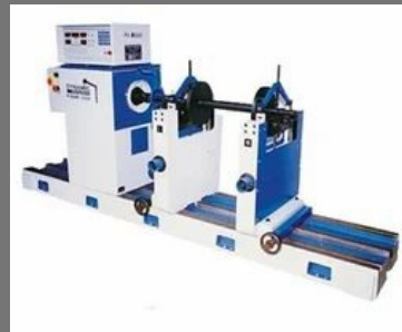
Horizontal Microprocessor Based Dynamic Balancing Machines