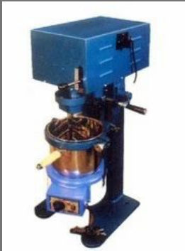
Mixer with Heating Jacket