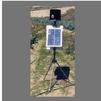
Digital Rainfall Recorder