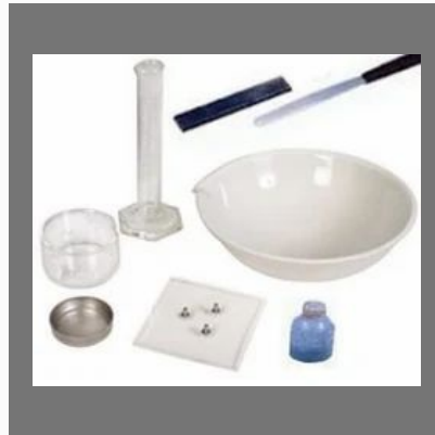
Shrinkage Limit Set