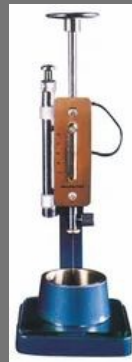
Vicat Needle Apparatus and Dash Pot