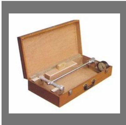
Proctor Needle Hydraulic Type