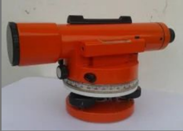
Prospector Dumpy Level