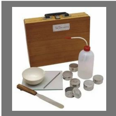
Plastic Limit Set