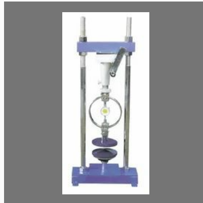
Unconfined Compression Tester Proving Ring Hand Operated