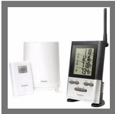
Digital Wireless Rain Gauge with Indoor & Outdoor Thermomete