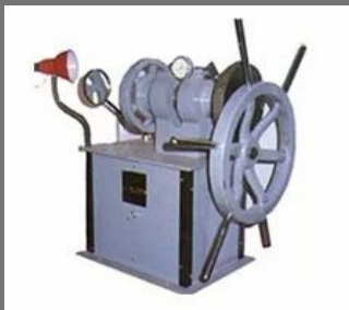
Erichsen Cupping Testing Machine