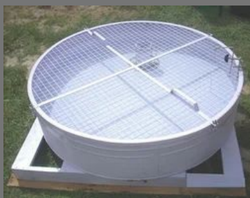
Open Pan Evaporimeter