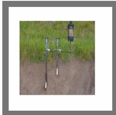
Soil Tension Meter