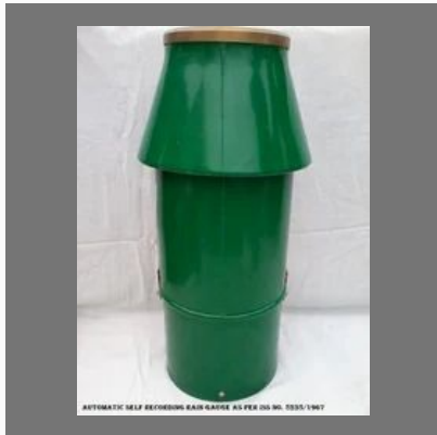
Self Recording Rain Gauge