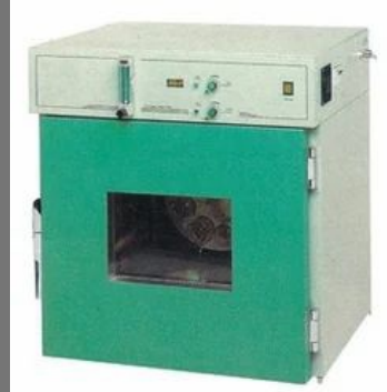
Rolling Thin Film Oven