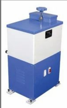
End Quench Test Apparatus