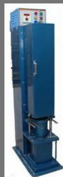
Automatic Bituminous Compactor