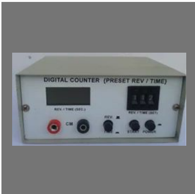
Digital LCD Counter for Water Current Meter