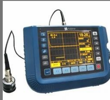
Ultrasonic Flow Detector