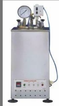
Laboratory Cement Autoclave