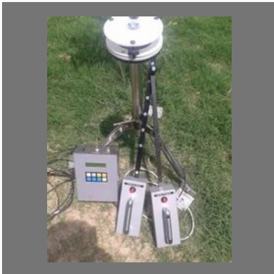
Plant Canopy Analyzer