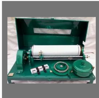
Automatic Water Level Stage Recorder