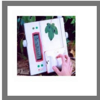
Portable Leaf Area Meter