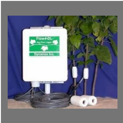
Sap Flow-Tdp Version