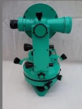
Vernier Transit Theodolite German Pattern