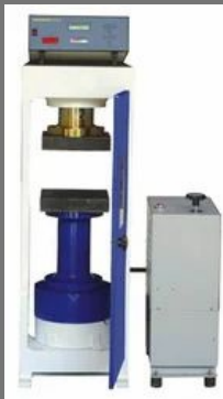
Compression Testing Machine Micro-controlled based