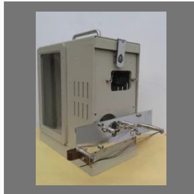
Thermo Hygro Graph