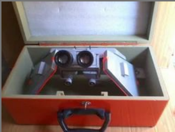
Mirror Stereoscope with 4X Binocular