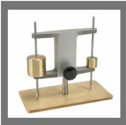
Gillmore Needle Apparatus