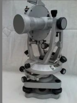
Vernier Transit Theodolite