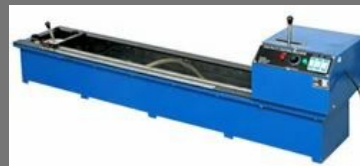
Ductility Testing Machine