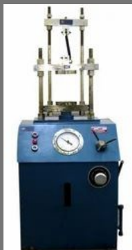
Universal Spring Testing Machine