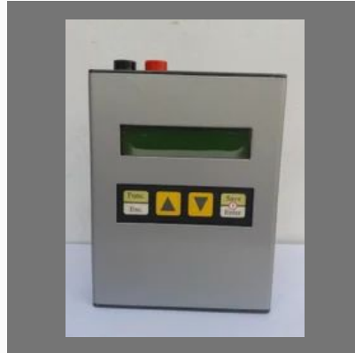
Direct Water Velocity Indicator for Water Current Meter