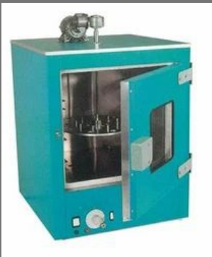
Loss on Heating/ Thin Film Oven