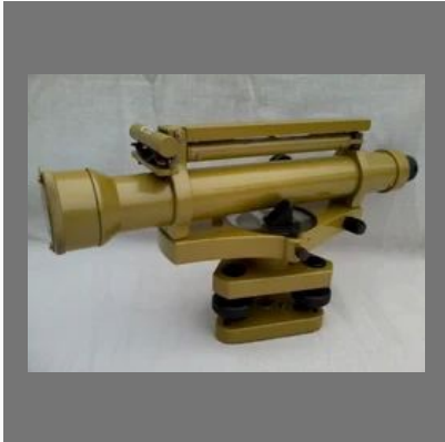
Dumpy Level Standard