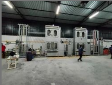
Lasing Tape Finishing Dyeing Machine