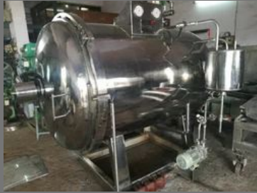
Fully Automatic Yarn Dyeing Machine