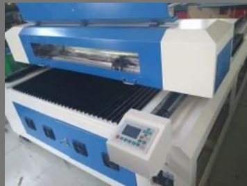
CNC Laser Cutting Machine