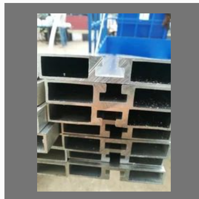
T Slot Aluminum Extrusion Profile