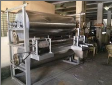
Dual Motor Automatic Finishing Machine