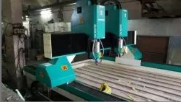
Double Head CNC Router For Stone Wood Glass