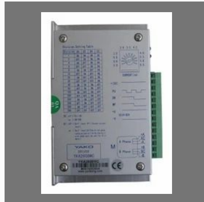
Yako 2608 Stepper Drivers