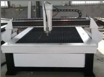
CNC Plasma Flame Cutting Machine