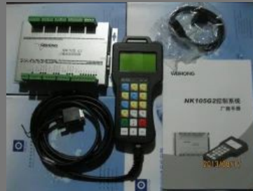
DSP Controller NK105 G2 CNC Router