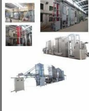
Webbing Pigment Continuous Dyeing and Finishing Machine