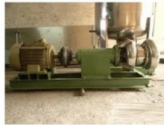
Yarn Dyeing Pump