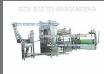
Sample Continuous Dyeing & Finishing Machine for Narrow Fabric