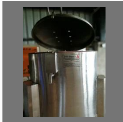
Hydro Extractors For Yarn Package