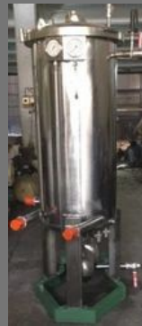
Yarn Dyeing Machine Set