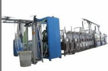
Continuous Dyeing Finishing Machine For Nylon Tape Etc