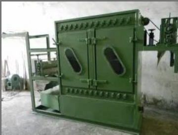
Polyester Tape ,Lace Finishing Machine