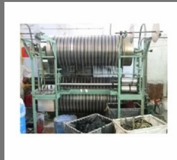
Elastic Tape Finishing Machine