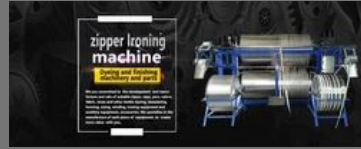
Zipper Iron Finishing Machine