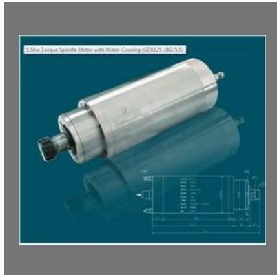
Water Cooled Spindle Motor