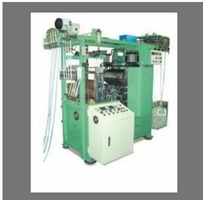
Ribbon Tape Calender Machine For Name Tape Label Tape Etc