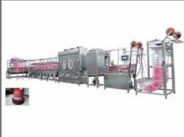
Elastic Tape Continuous Dyeing Machine PLC Automatic