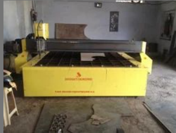
CNC Plasma 2040 Routers