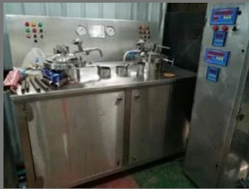
1 Kg Yarn Dyeing Machine