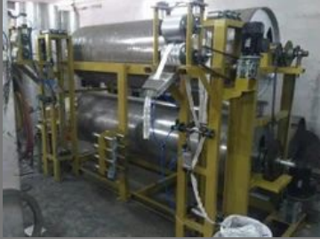
Zipper Tape Finishing Machine-