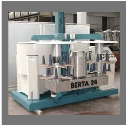
Centrifugal Hydro Extractor Machine For Yarn Package