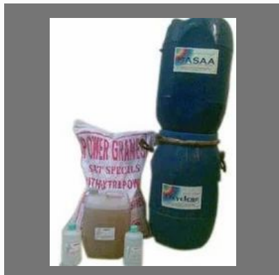
Surface Active Agent