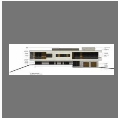
Composite Penal Wood N Home Design