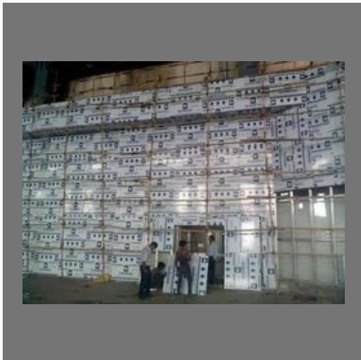
Glass & Composite Building Design