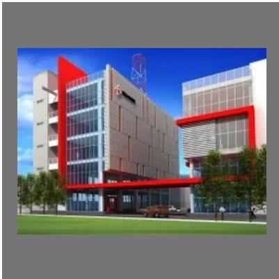
Aluminum Composite Panel