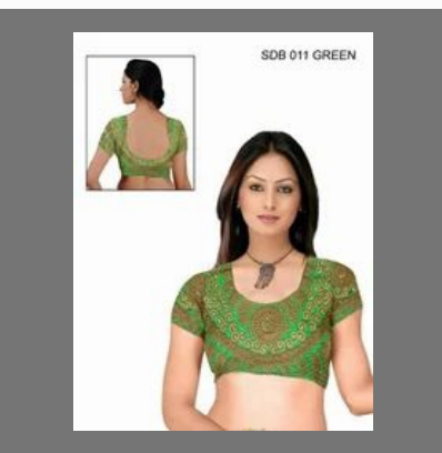
Sdb011 Designer Blouse