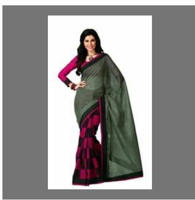
Queen Printed Bhaglpuri Silk Saree