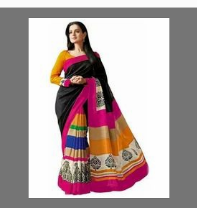
Printed Bhaglpuri Silk Saree