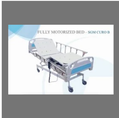
Fully Motorized Bed