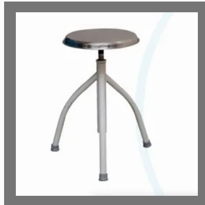
SS Top Revolving Stool