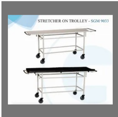
Stretcher On Trolley