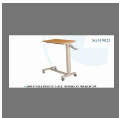
Adjustable Bedside Table Membrane Pressed Top