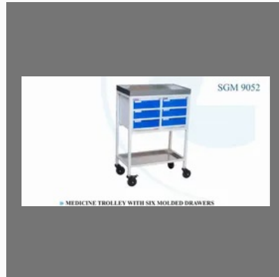
MEDICINE TROLLEY WITH SIX MOLDED DRAWERS