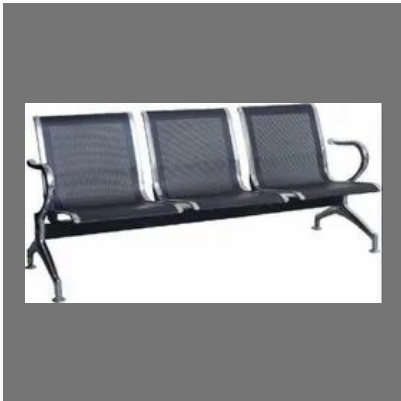
Waiting 3 Seater IMP Black