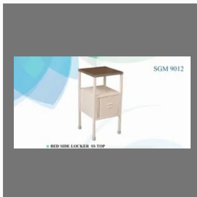
Bed Side Locker SS Top