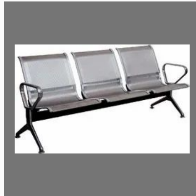
SS Waiting 3 Seater IMP