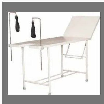
Examination Gynaec Table