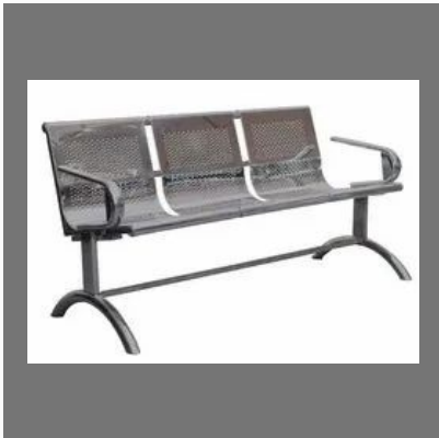
Fully SS Waiting Three Seater