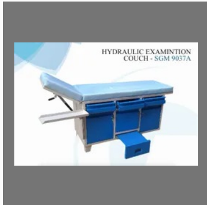
Hydraulic Examination Couch