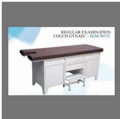
Regular Examination Couch Gynaec