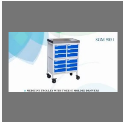
MEDICINE TROLLEY WITH TWELVE MOLDED DRAWERS