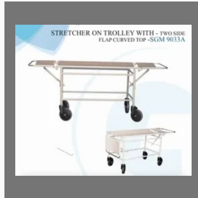
Stretcher On Trolley With Two Side Flap Curved Top