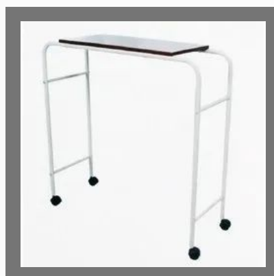
Over Bed Table With Laminated Top