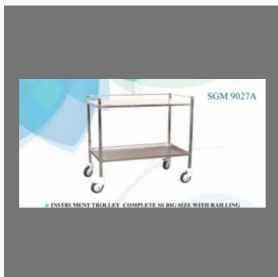
Instrument Trolley Complete SS Big Size with Railing