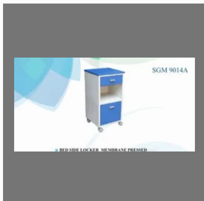
Bed Side Locker Membrane Pressed