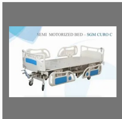
Semi Motorized Bed