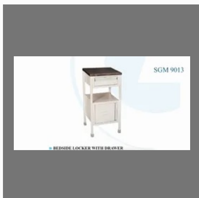
Bedside Locker With Drawer