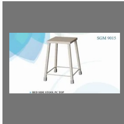
Bed Side Stool Pc Top