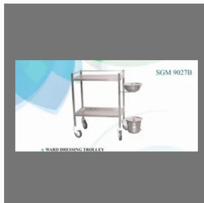
Ward Dressing Trolley