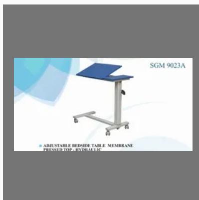
Adjustable Bedside Table Membrane Pressed Top Hydraulic