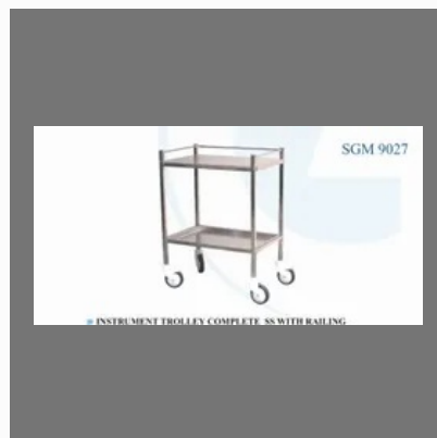
INSTRUMENT TROLLEY COMPLETE SS WITH RAILING