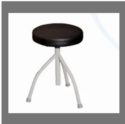
Revolving Stool With Cushioned Top