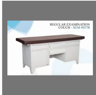
Regular Examination Couch