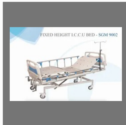
Fixed Height I.C.C.U Bed