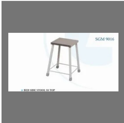
Bed Side Stool SS Top