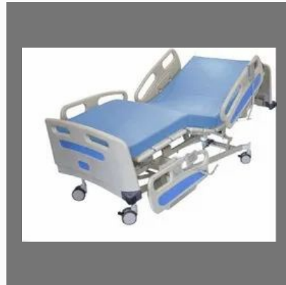
Fully Motorized Bed