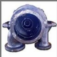
Casting For Pumps