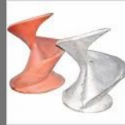
Casting For Marine & Dredging