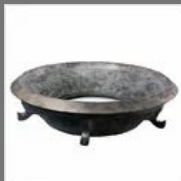
Casting Components For Mining