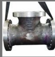
Casting For Valves