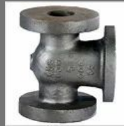
Casting For Valves