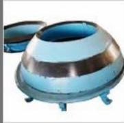
Casting Components For Mining