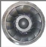
Casting For Pumps