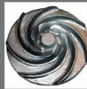
Casting For Marine & Dredging