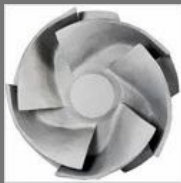
Casting For Marine & Dredging