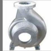
Casting For Pumps