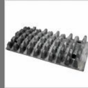
Casting Components For Mining