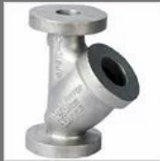
Casting For Valves