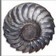
Casting For Pumps