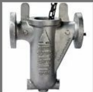
Casting For Valves