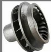
Hydro Turbine Castings