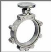
Casting For Valves