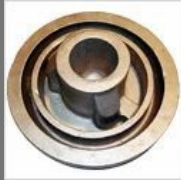
Casting For Marine & Dredging