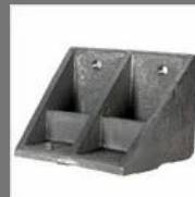
Casting Components For Mining