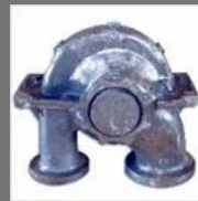
Casting For Pumps