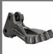
Casting Components For Mining