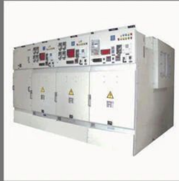
HT VCB Control Panel