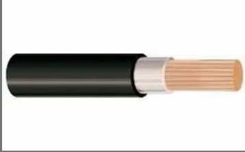
Single Core Copper Flexible Cables