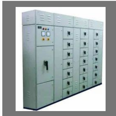
Main PCC Control Panel