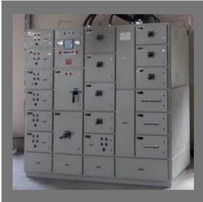
Erection & Commissioning HT / LT Panels