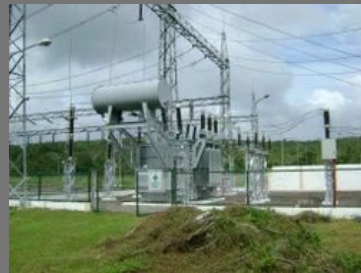
Supply, Erections, Testing & Commissioning of Power Lines