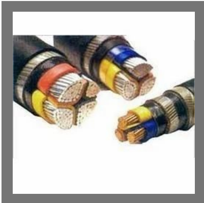
Copper Armored Cables