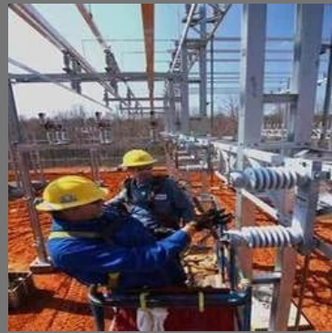
Electrical Consultancy Service