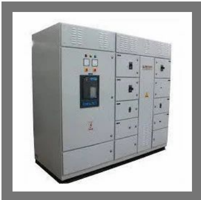
Power Distribution Control Panel