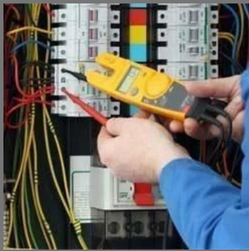
Electrical Earthing Contractor Service