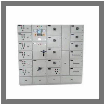
Electrical Control Panel