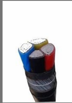
Aluminum Armored Cables