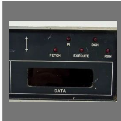
Harmonic Filter Control Panel