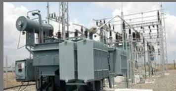
EHV Switch Yards / Substation