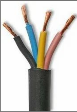
Four Core Copper Flexible Cables